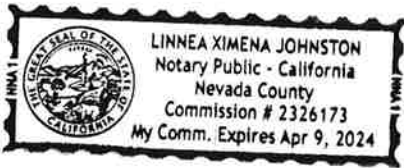
Place Notary Seal and/or Stamp Above

Signature [Signature] Signature of Notary Public