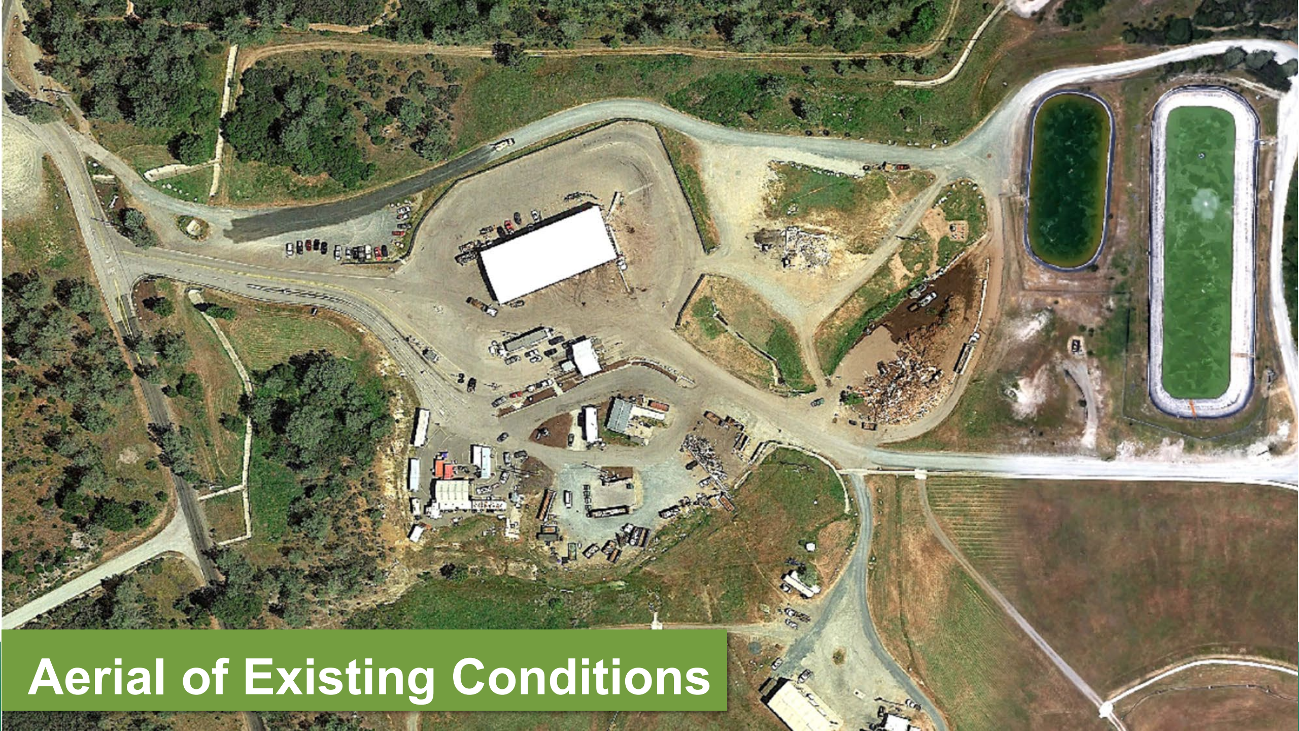
Aerial of Existing Conditions