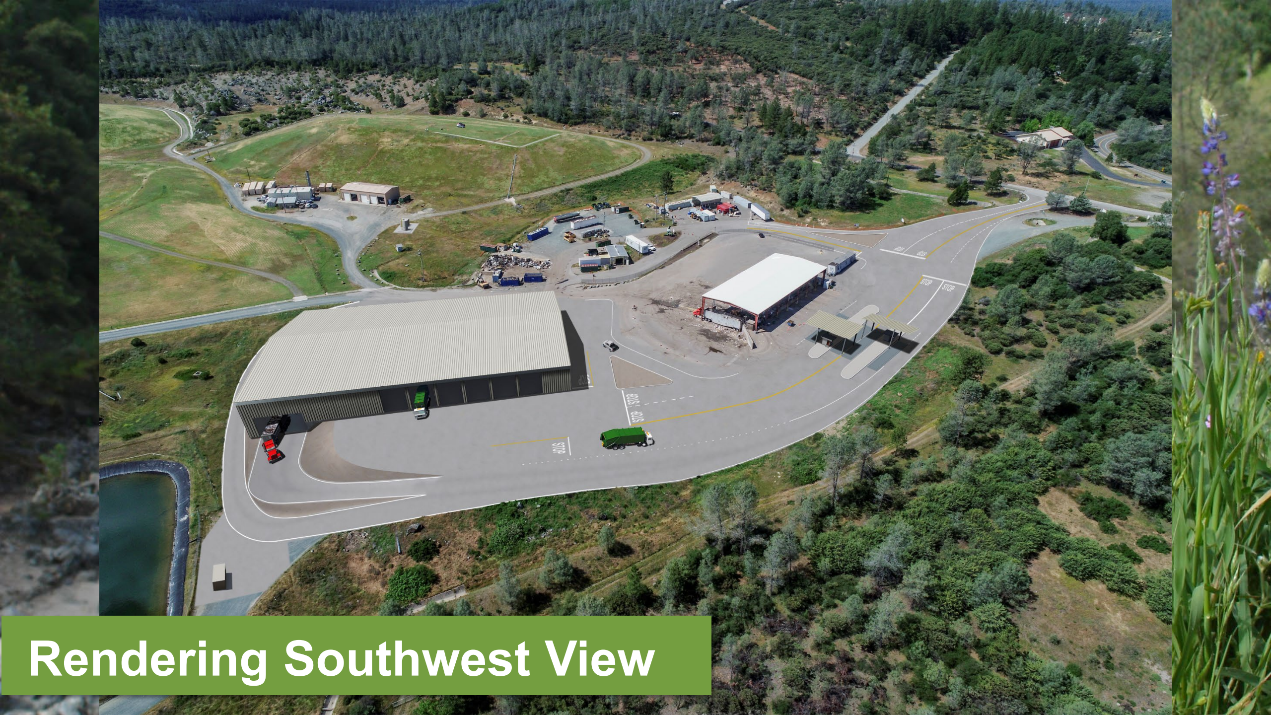
Rendering Southwest View