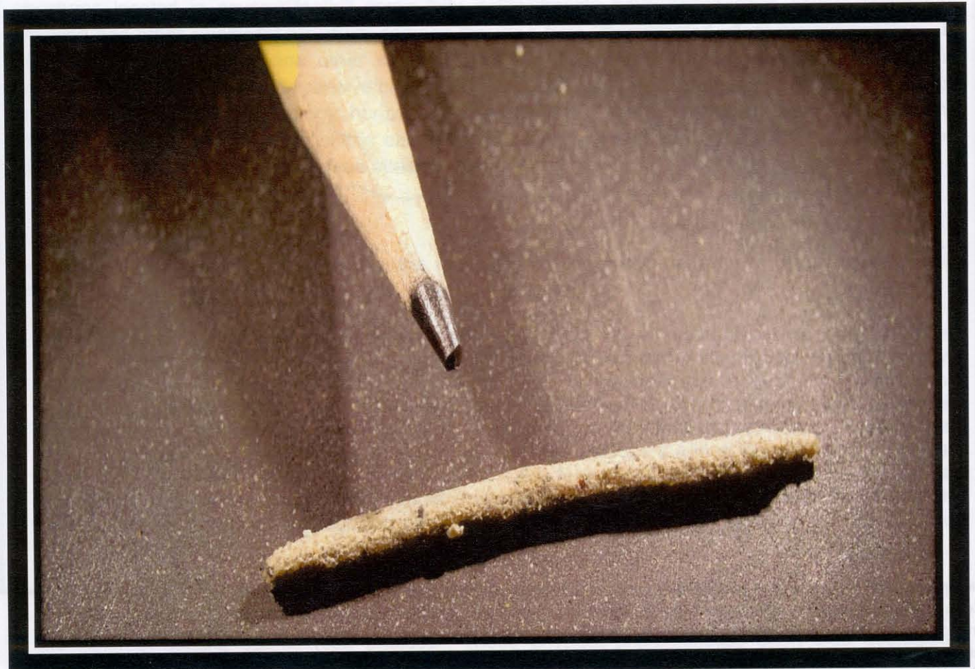
Same fine-grained sand after adding moisture and hand rolling the sample.