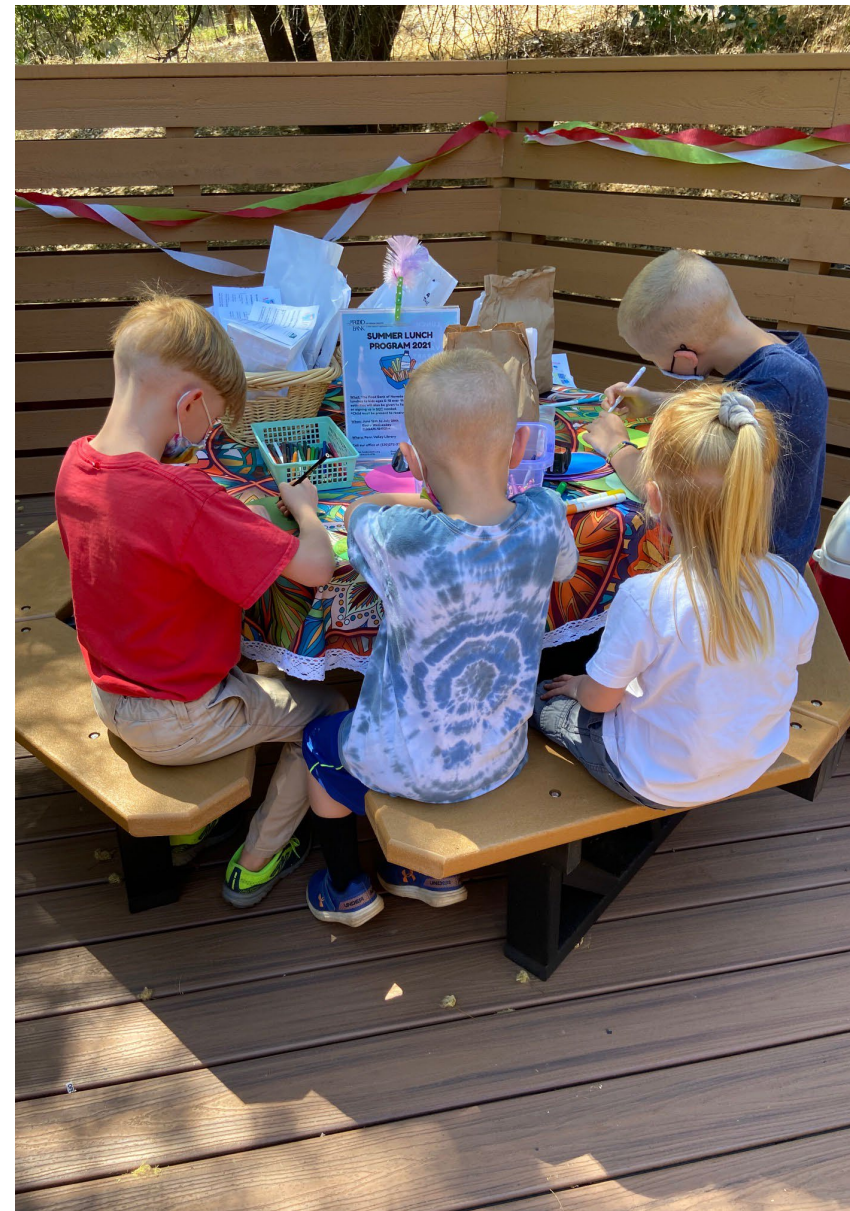
Lunch and crafts outside the Penn Valley Library