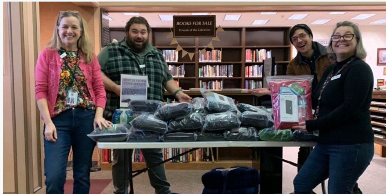
► Nevada County Library blanket giveaway during winter storm 2023.

This section identifies potential funding mechanisms for future project development and operations. The challenge for the County of Nevada will be to leverage existing or available funding while navigating the need and desire of the community for new and innovative methods for financing planned improvements, facilities, programming and operational needs. These potential sources represent a “point in time” and should be refreshed periodically to respond to new opportunities, changing regulatory requirements, partnerships and land use scenarios that will impact funding sources over time.