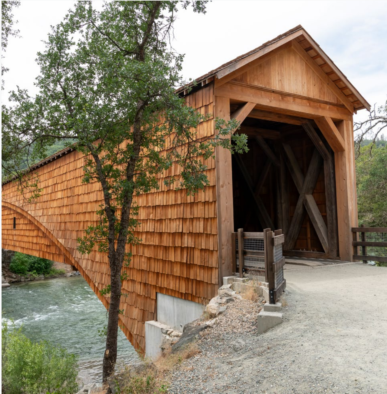
Bridgeport covered bridge

Moving forward, the County of Nevada’s role will be to advance the Master Plan vision and road map by working with land managers, volunteers, residents, and users to enhance recreation access, improve health