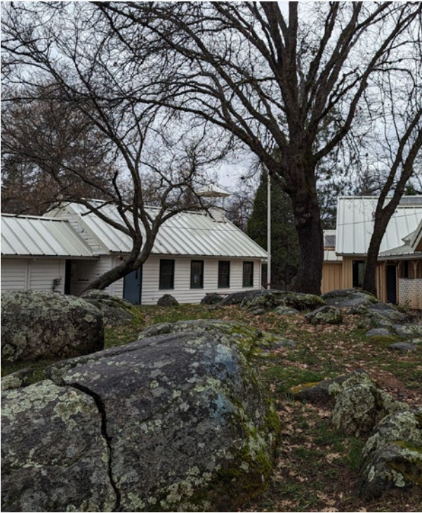
San Juan Ridge Family Resource Center