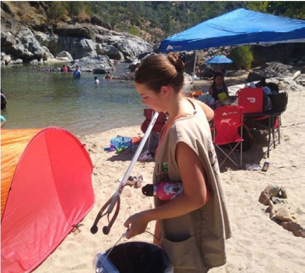
River Ambassador program funded through the Outdoor Visitor Safety Fund