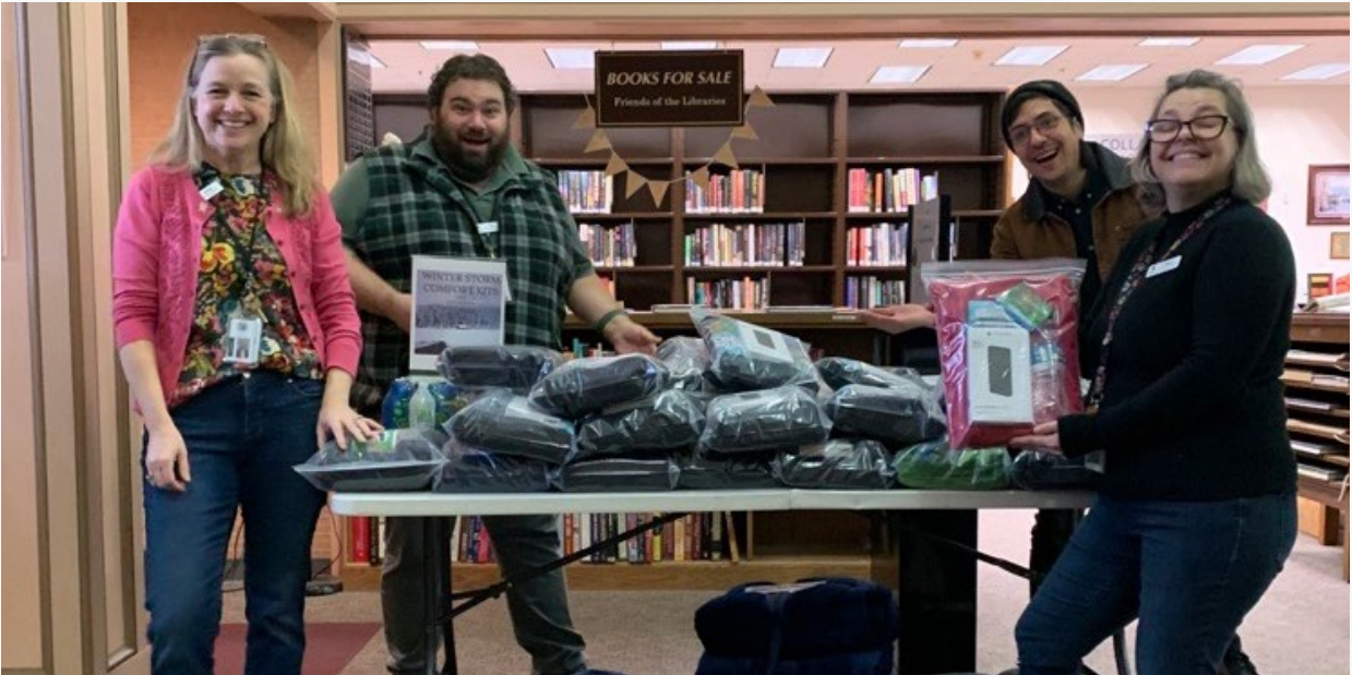
► Nevada County Library blanket giveaway during winter storm 2023.

This section identifies potential funding mechanisms for future project development and operations. The challenge for the County of Nevada will be to leverage existing or available funding while navigating the need and desire of the community for new and innovative methods for financing planned improvements, facilities, programming and operational needs. These potential sources represent a “point in time” and should be refreshed periodically to respond to new opportunities, changing regulatory requirements, partnerships and land use scenarios that will impact funding sources over time.