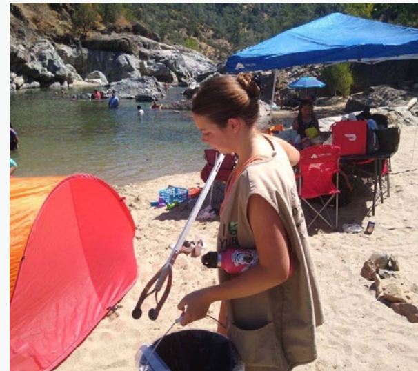
River Ambassador program funded through the Outdoor Visitor Safety Fund