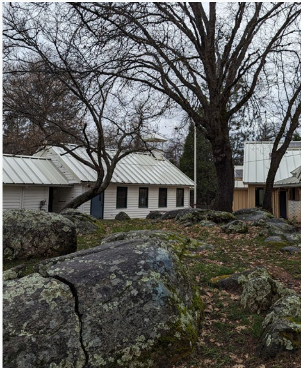
San Juan Ridge Family Resource Center