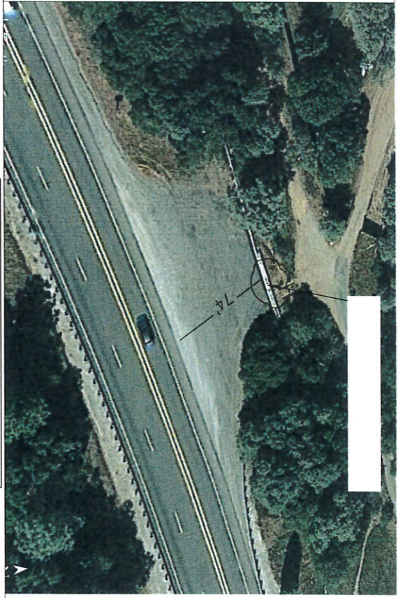
PLAN VIEW - SR 20 PM R8.342