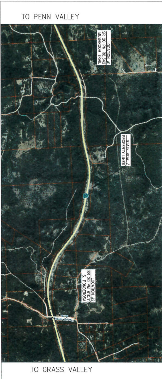
SITE PLAN - SR 20 PM R8.0 TO R10.5