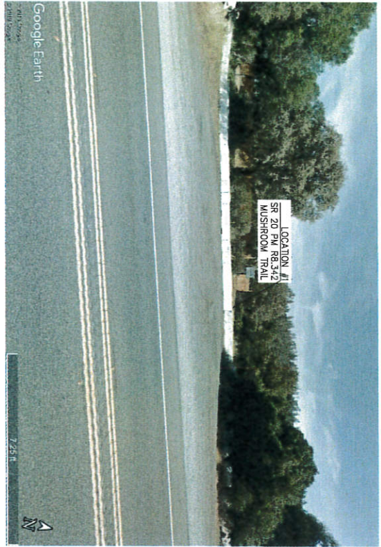
PROFILE VIEW - SR 20 PM R8.342