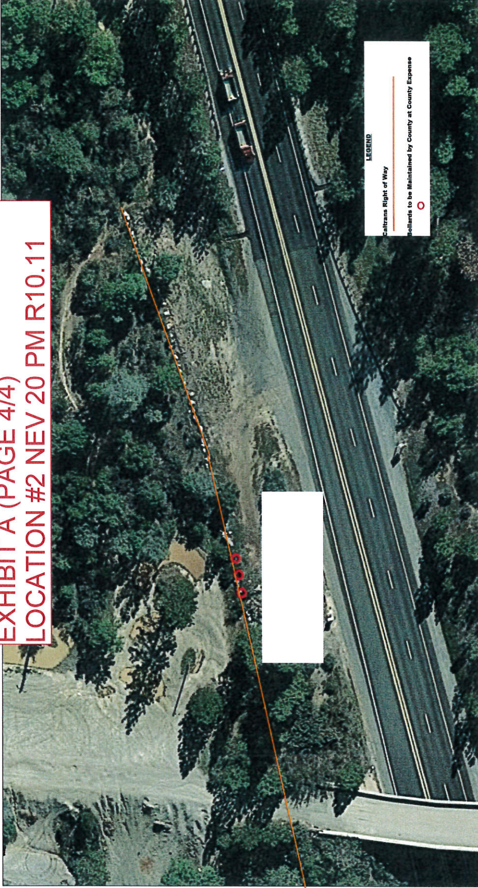
EXHIBIT A (PAGE 4/4) LOCATION #2 NEV 20 PM R10.11

LEGEND Caltrans Right of Way Roads to be Maintained by County at County Expense