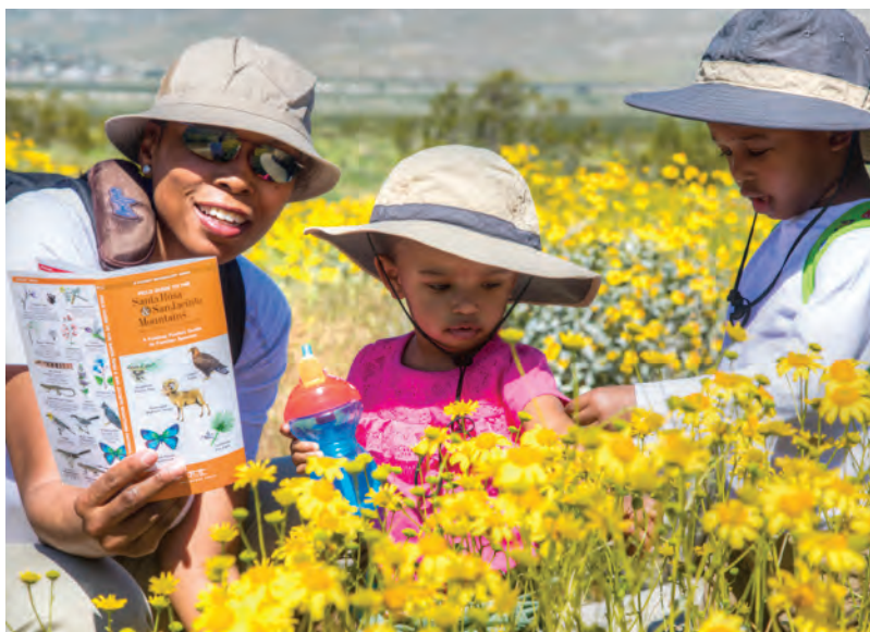
Admiring wildflowers along California's Pacific Crest National Scenic Trail.

Demand for outdoor recreation is at an all-time high. As of 2021, approximately half of all adults across the United States participate in outdoor recreation on at least a monthly basis. About 20% of participants may be new to outdoor recreation since the start of the pandemic (Taff et al., 2021). The number of outdoor recreationists is expected to hold steady in the near term, as people who tried outdoor recreation for the first time in 2020 have continued to participate in 2021 (Outdoor Foundation, 2022). In national surveys, nine in 10 people express support for outdoor recreation and local parks, agreeing that