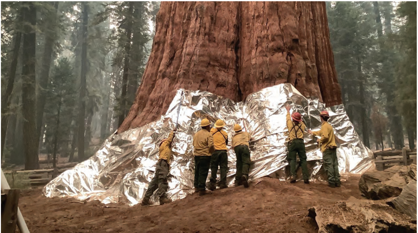
Firefighters and natural resource specialists apply a protective fire-shelter wrap to the General Sherman Tree in Sequoia National Park, CA, during the KNP Complex Fire in 2021.

The California Wildfire and Forest Resilience Task Force assigned Key Actions 3.13 and 3.14 of the Action Plan to the Sustainable Recreation/CALREC Vision Key Working Group (Key Working Group). Key Action 3.13 was completed by the Key Working Group through consultations with the California Department of Parks and Recreation (State Parks). Please see additional discussion of Key Action 3.13 on page 13. Key Action 3.14 is the more immediate subject of this Joint Strategy document.