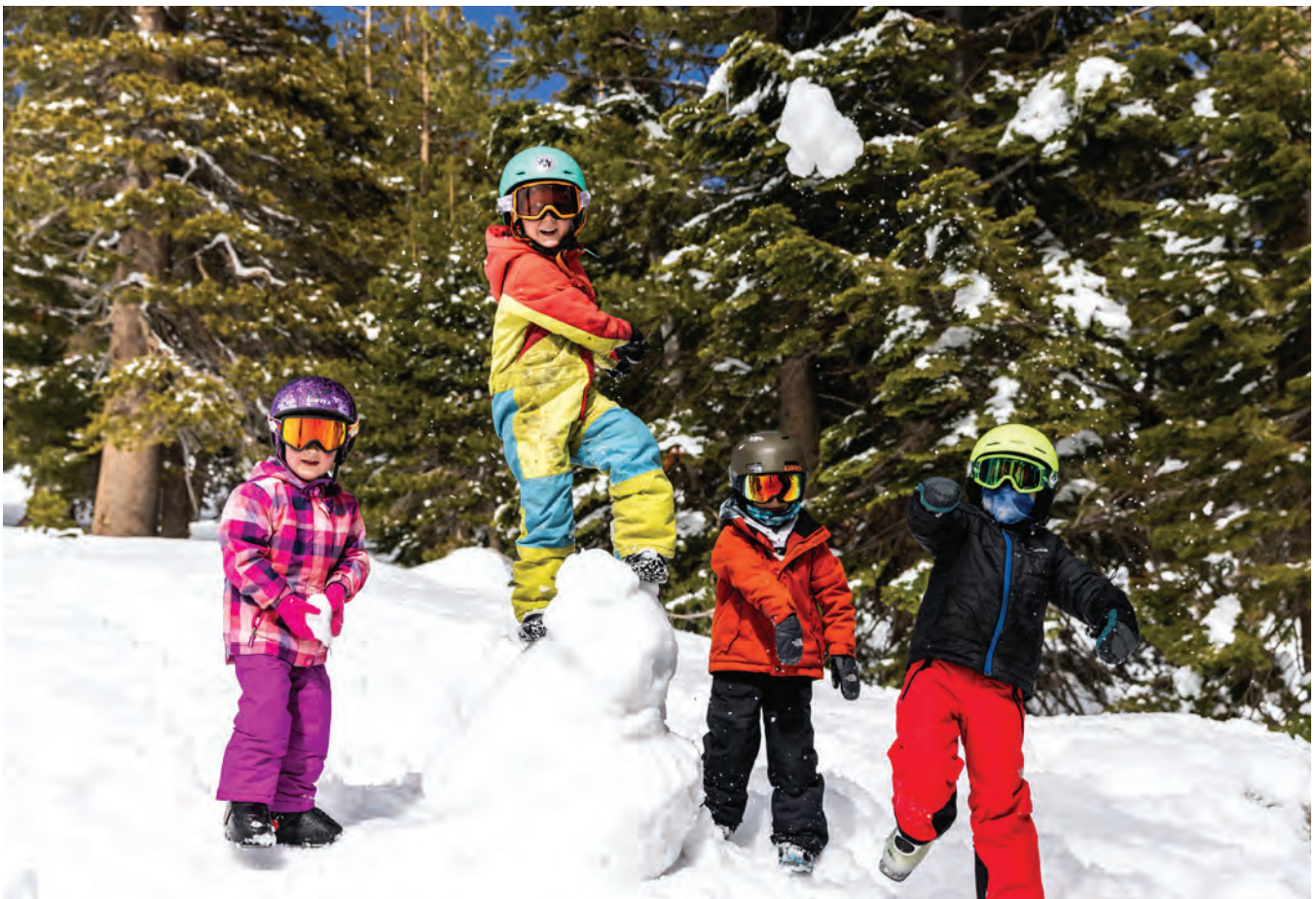
Children play in the snow near California's Sierra-at-Tahoe.

California and its partners are committed to providing outdoor recreation opportunities that nurture the mental, physical, spiritual, and emotional health and safety of all people while protecting our natural resources. Wildfires and other natural disasters can impede access to outdoor recreation at a time when people need it most for their well-being. To address this need for outdoor recreation opportunities before, during, and after natural disasters, we will communicate proactively with residents and visitors to promote the healthy enjoyment of outdoor recreation, inform people of where facilities are available, and apprise people of how to avoid smoke exposure and other risk factors. We will prioritize the development of resilient recreation opportunities that can function as alternative sites when other facilities are closed or inaccessible. The development of safe places to recreate is vitally important in ensuring safe access for all.