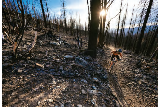
Mountain biking before and after the Dixie Fire in 2021, near Quincy, CA.

The purpose of this Joint Strategy is to provide the California Wildfire and Forest Resilience Task Force with a road map for how to protect and improve sustainable outdoor recreation assets and access in the context of wildfire and natural disaster planning and response. The audience of this Joint Strategy includes the U.S. Forest Service (USFS), the state of California, land managers, and the extended outdoor recreation community. This Joint Strategy emphasizes the fact that sustainable outdoor recreation opportunities must be high-quality and resilient to meet the needs of a diverse and growing population and changing climate.