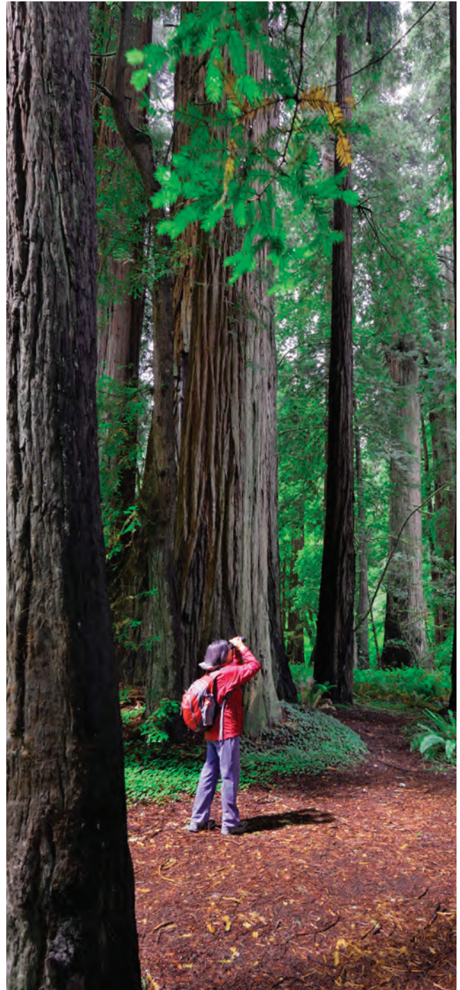
Birdwatching at the Stout Memorial Grove in Jedediah Smith Redwoods State Park, CA.

California is home to some of the most beautiful and celebrated landscapes on Earth. More than 100 Native American tribes have stewarded and protected California's lands and waters from time immemorial through the present day. Often, places valued as recreation sites today hold significant cultural and ecological importance for Indigenous peoples. Acknowledging California as the homeland of Native American tribes is just a small step to take in the spirit of truth and healing. This Joint Strategy attempts to elevate California Native governments, communities, peoples, and priorities into the collective thinking about sustainable outdoor recreation, inclusive access to the outdoors, and wildfire resilience. Realizing the privilege of those who recreate outside, this Joint Strategy hopes to contribute to further discussions of appropriate and respectful public access to valued and significant places.