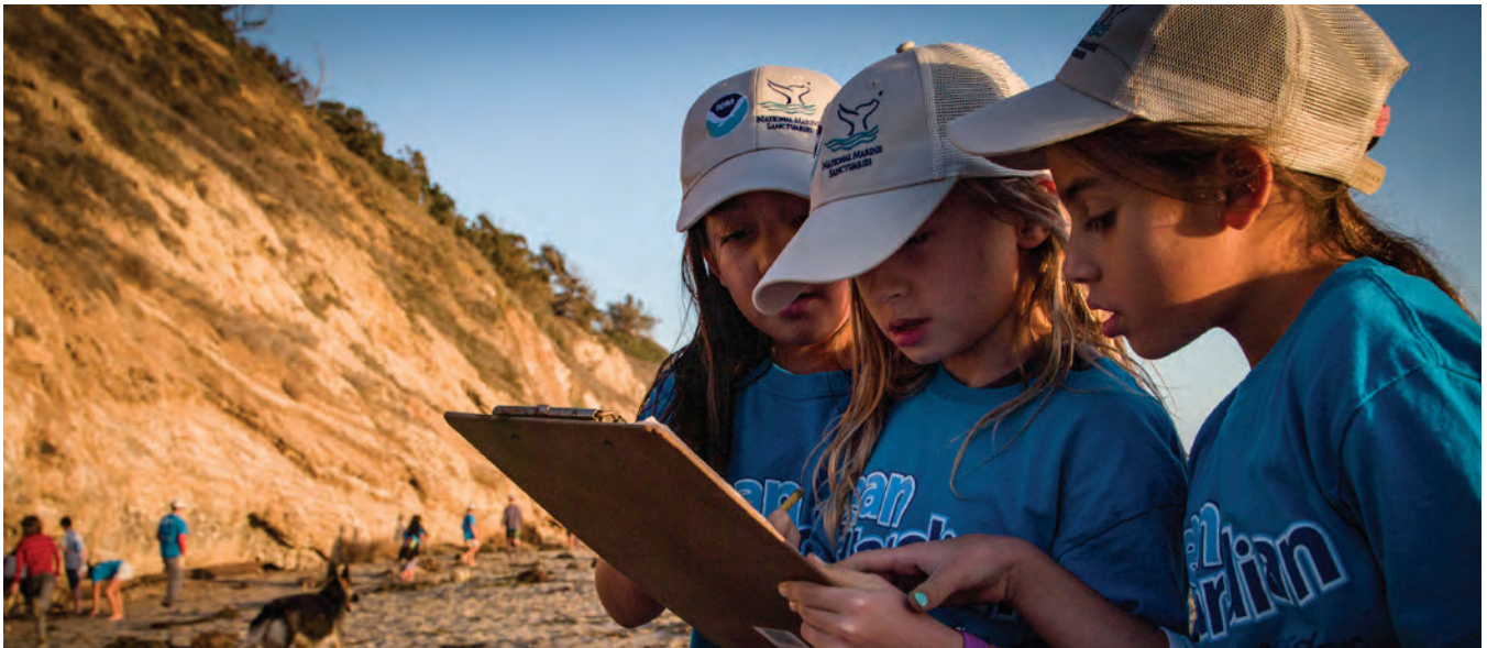
Children record observations on a clipboard at California's Channel Islands National Marine Sanctuary as part of the Ocean Guardian program.

The Key Working Group developed the Joint Strategy for Sustainable Outdoor Recreation and Wildfire Resilience (Joint Strategy) to provide a road map for improved access to sustainable outdoor recreation in an era when wildfires are having tremendous impacts on outdoor recreation opportunities throughout California. The Joint Strategy recognizes that our recreation system exists within a vast network of watersheds that stretches all the way from the headwaters in the mountains to the Pacific Ocean. Our recreation system is affected by wildfires and natural disasters in profound ways both upstream and downstream from where people recreate. The Key Working Group consisted of staff from federal and state agencies, regional and local agencies, industry, and nongovernmental organizations. The Mammoth Lakes Trails and Public Access Foundation (MLTPA) convened the Key Working Group. The Consensus and Collaboration Program of the College of Continuing Education at Sacramento State University provided facilitation. Climate Equity Solutions Inc. contributed drafting and editing services, under contract to MLTPA.