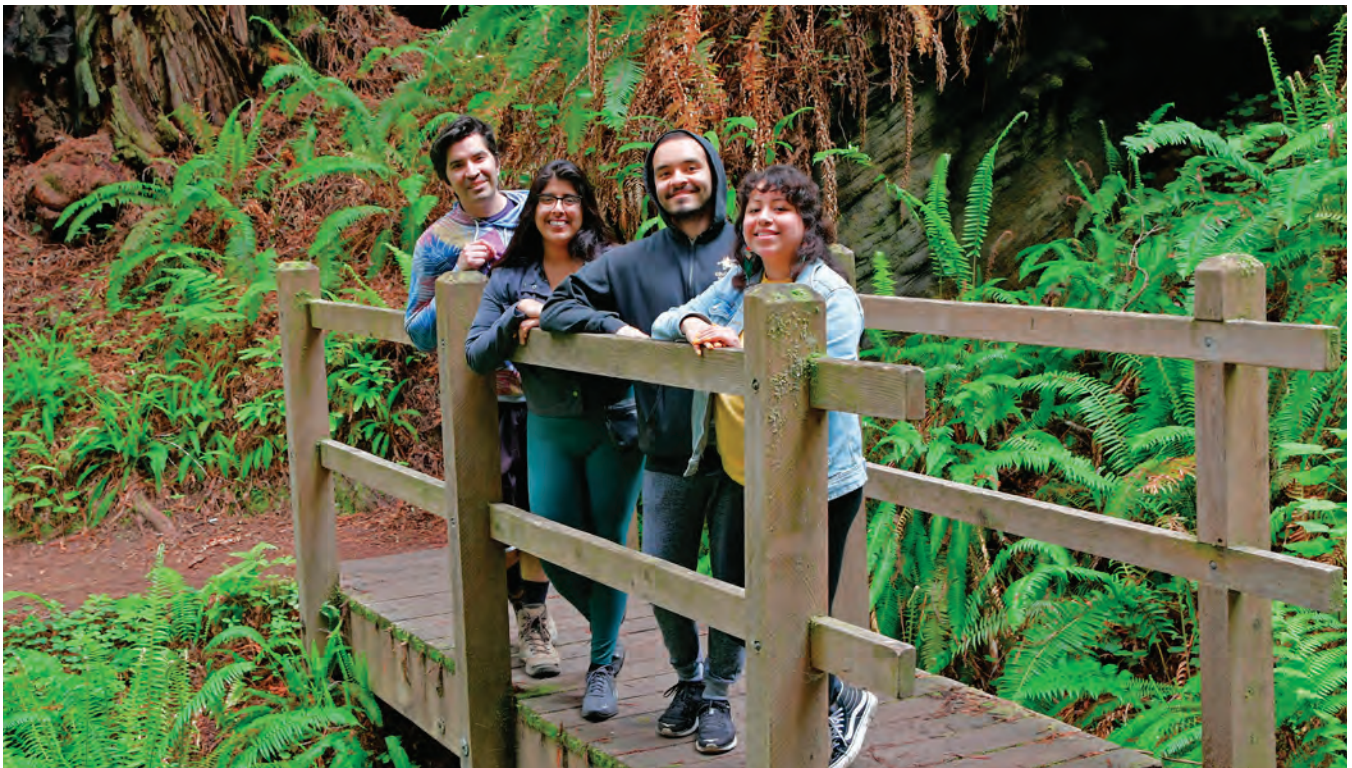
Posing on a bridge along the Trillium Falls Trail in Redwood National and State Parks, CA.

California and its partners must build upon and expand an inclusionary culture of sustainable outdoor recreation, promoting equitable access across California's public lands and waters that reflects the diversity of all peoples and the legacy of our Native American history, culture, and use. Inspired by the California Natural Resources Agency's Outdoors for All initiative, our work will strive to address long-standing environmental, social, and economic inequities in our society that have resulted in physical and societal barriers to outdoor recreation access for underserved and underrepresented residents. Improvements to outdoor recreation access, including planning, programming, and infrastructure, will be co-created with communities, forest health, and wildfire response partners and designed around community values to be resilient to increasingly frequent wildfires and natural disasters. Advancing equitable access will require a high level of engagement with underserved and underrepresented populations to prioritize and implement integrated outdoor recreation access and wildfire risk reduction, resiliency, and recovery actions that provide respite for these communities year-round and especially during times of disaster.