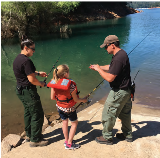
Fisheries and recreation employees teach local third-graders to fish on Kids Fishing Day at Shasta Lake, CA.

The following section describes the state and federal policies that authorized, inspired, and guided the creation of this Joint Strategy.