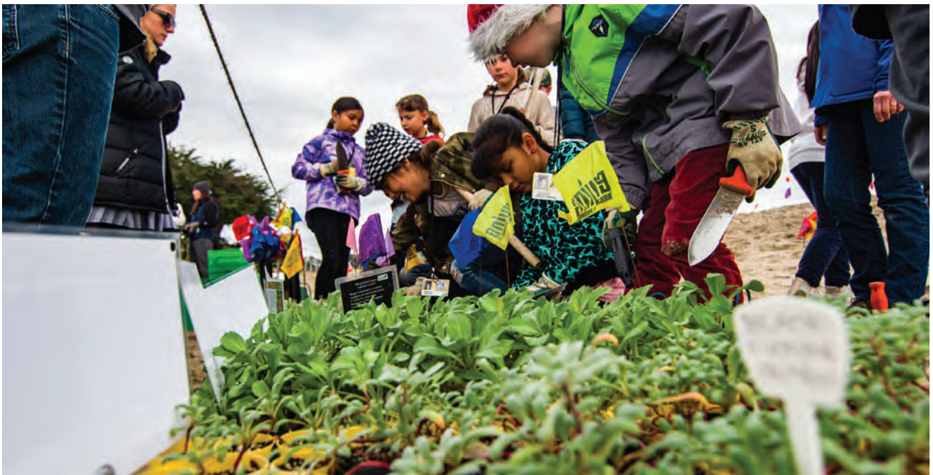
Planting seedlings on the beach at California's Monterey Bay National Marine Sanctuary.