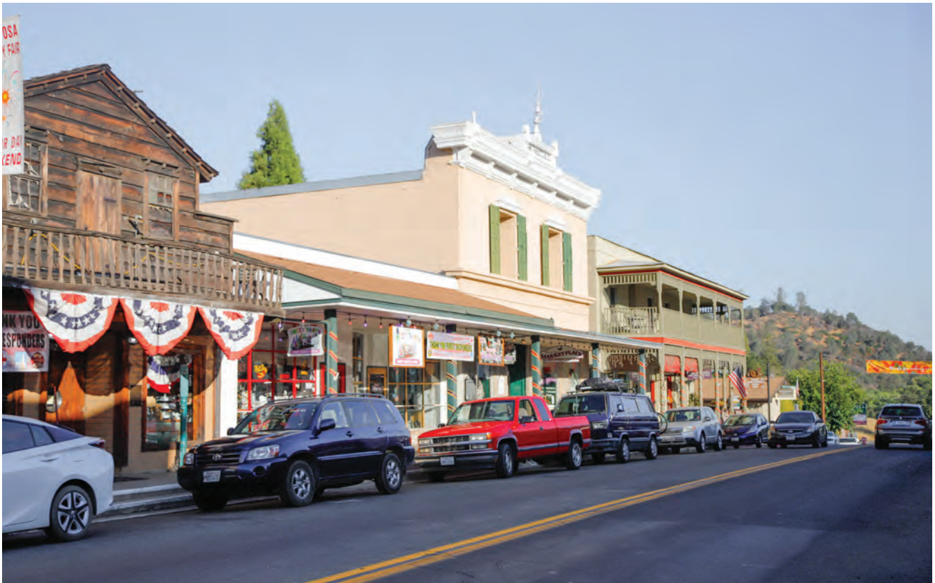
Downtown Mariposa, CA, in close proximity to Yosemite National Park.

Communities and their sustainable outdoor recreation economies enhance the physical, social, and economic vitality of California and, by nature of their dependence on public lands and waters, often play a critical role in ensuring that public lands and waters are maintained and resilient to climate change and wildfires. These communities are well positioned to provide safe, equitable, and inclusive access to outdoor recreation opportunities. Direct recreation spending, jobs, and tourism revenue contribute prominently to these forest and gateway communities. As has been increasingly demonstrated during the past decade, climate change and massive wildfires are having a devastating impact on our communities and their recreation economies. While wildfire risk reduction is key, more should be done to ensure that our recreation-based communities can respond and recover after wildfires and other natural disasters to support community resilience, economic vitality, and local jobs.