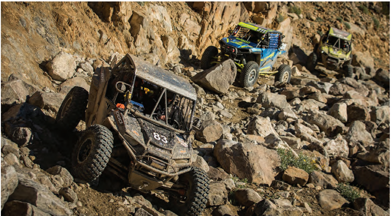
UTVs compete at the King of Hammers event in California's Johnson Valley OHV Area. ATVing and recreational motorcycling generated $8 billion in GDP nationally in 2021, according to the Bureau of Economic Analysis.