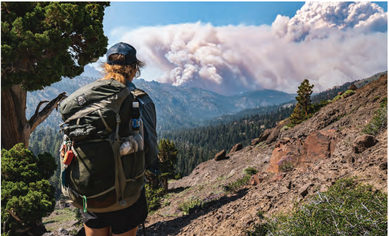
A hiker looks at smoke from the 2021 Caldor Fire in the distance.

Our aim is to promote forest health and resiliency alongside sustainable outdoor recreation for all throughout California. We recognize that forest health and outdoor recreation mutually depend on one another and that our management of them needs to be integrated. This goal promotes public access and enjoyment of our forests and public lands and all the benefits that come with that while at the same time addressing the impacts and mitigating factors of outdoor recreation from catastrophic wildfires and climate effects. By ensuring healthy lands and waters, outdoor recreation users feel connected to nature in places and communities that are socially, economically, and environmentally rich and resilient.