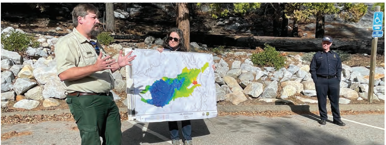
Leadership from the U.S. Forest Service, Sierra Nevada Conservancy, and CAL FIRE discuss the effect of vegetation treatment on burn severity during the Caldor Fire in 2021.