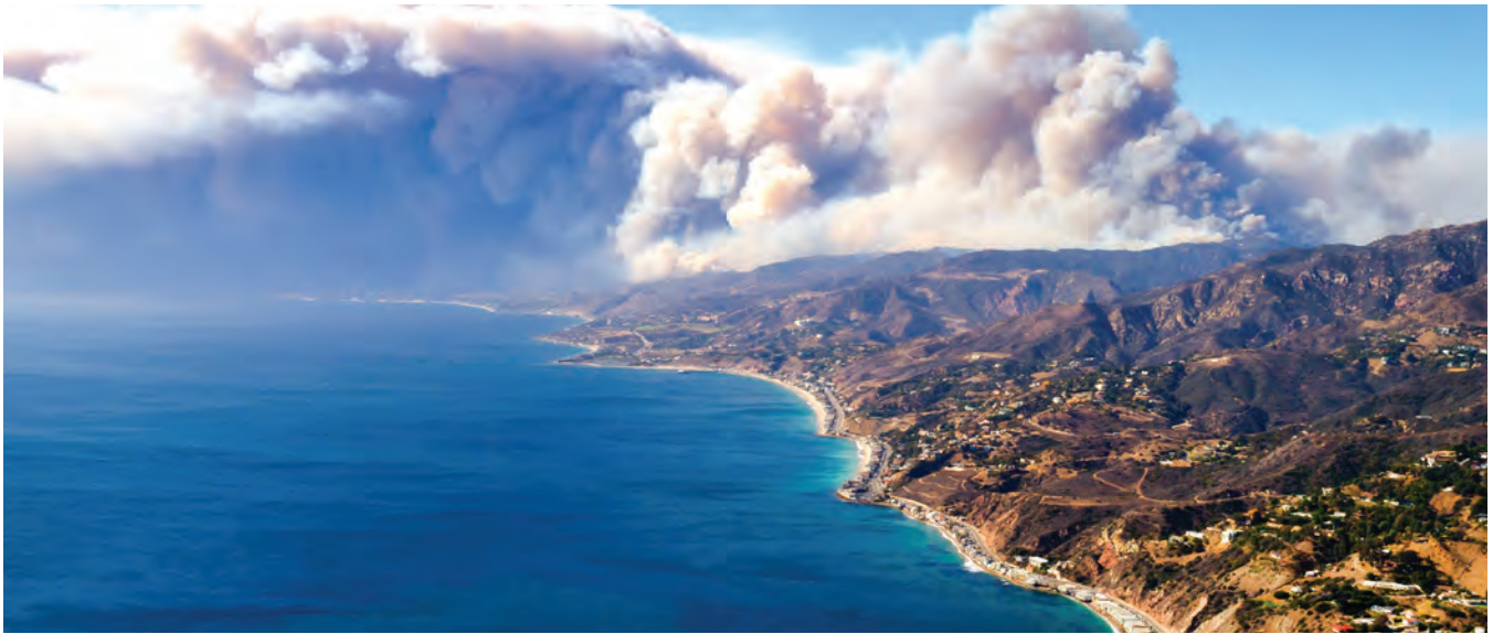
The Woolsey Fire burns near the coast in 2018 in Los Angeles and Ventura counties, prompting smoke advisories in Los Angeles, Ventura, Orange, Riverside, and San Bernardino counties.