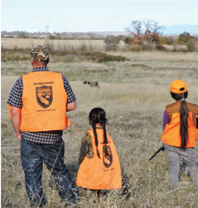
The Annual Pheasant Hunt at the Sacramento River Bend Outstanding Natural Area, CA, where youth and women can learn safe hunting techniques and traditional practices.