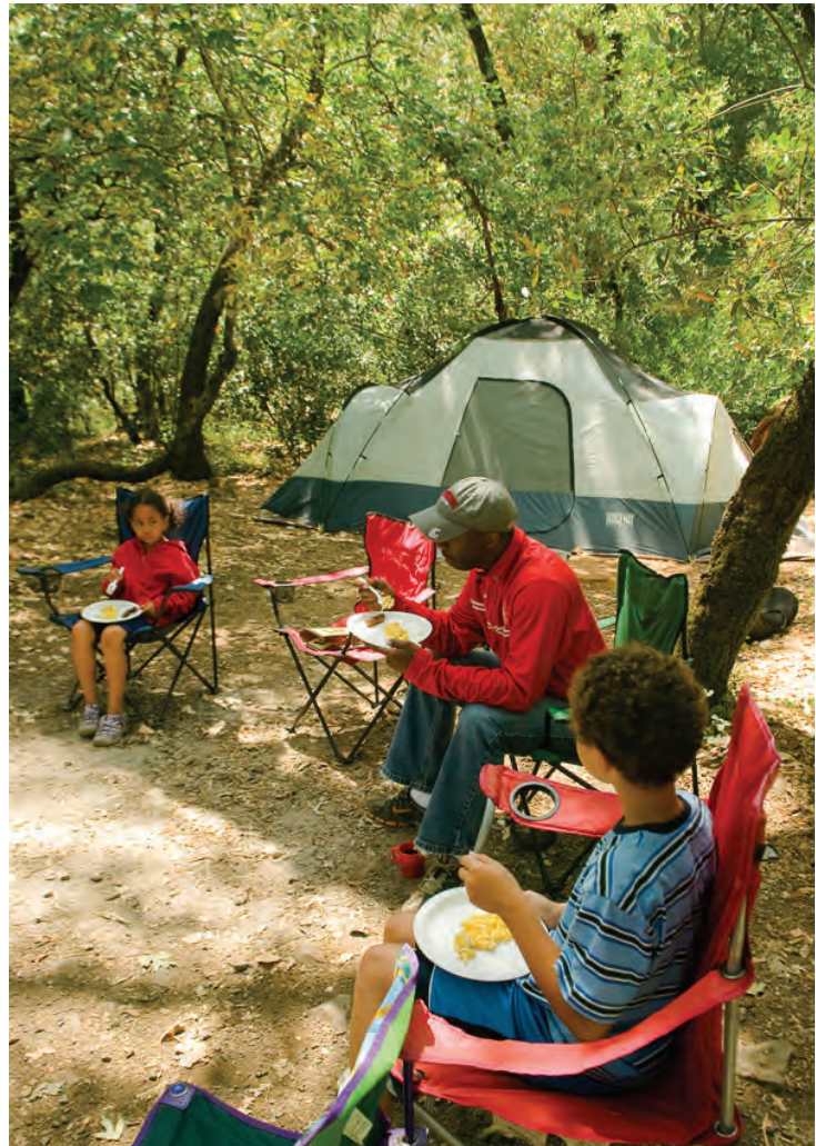
Enjoying a meal while camping at Bothe-Napa Valley State Park, CA.

Due to a variety of factors, the release of the 2021–2025 SCORP occurred in early 2022, as the Key Working Group convened to begin its work on the development of the Joint Strategy. As a result of this timing, representatives from the Key Working Group were able to meet with staff from the California Department of Parks and Recreation to discuss opportunities to recommend priorities and help to inform the vision of the 2026–2030 SCORP update, set to begin in 2023. During these discussions, it was acknowledged that the next update to the SCORP might be enhanced to capture the broadened scope and landscapes of outdoor recreation in California.