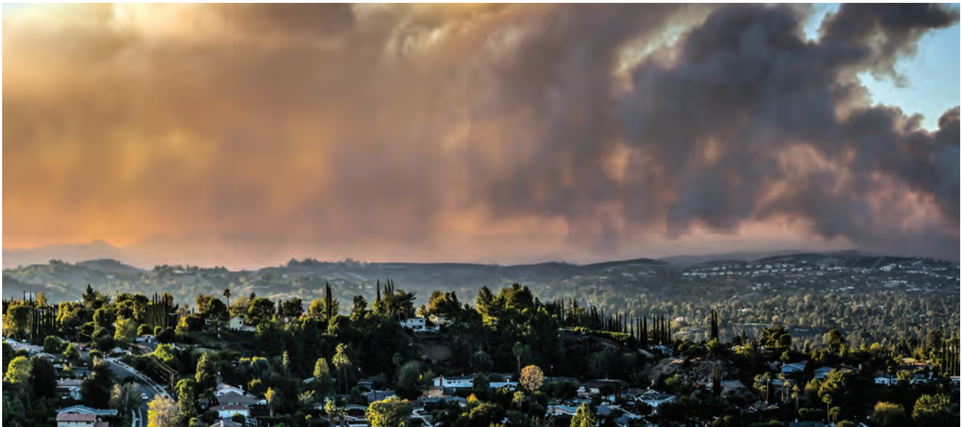
Smoke from the Woolsey Fire in 2018, seen from Topanga, CA.