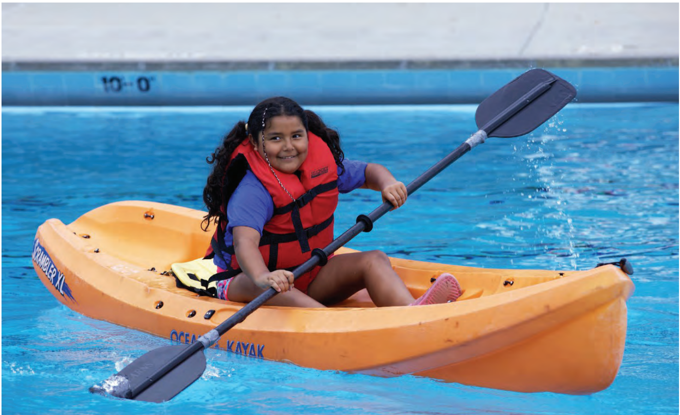
Kayaking in an indoor pool can serve as a recreation opportunity during wildfire smoke events.