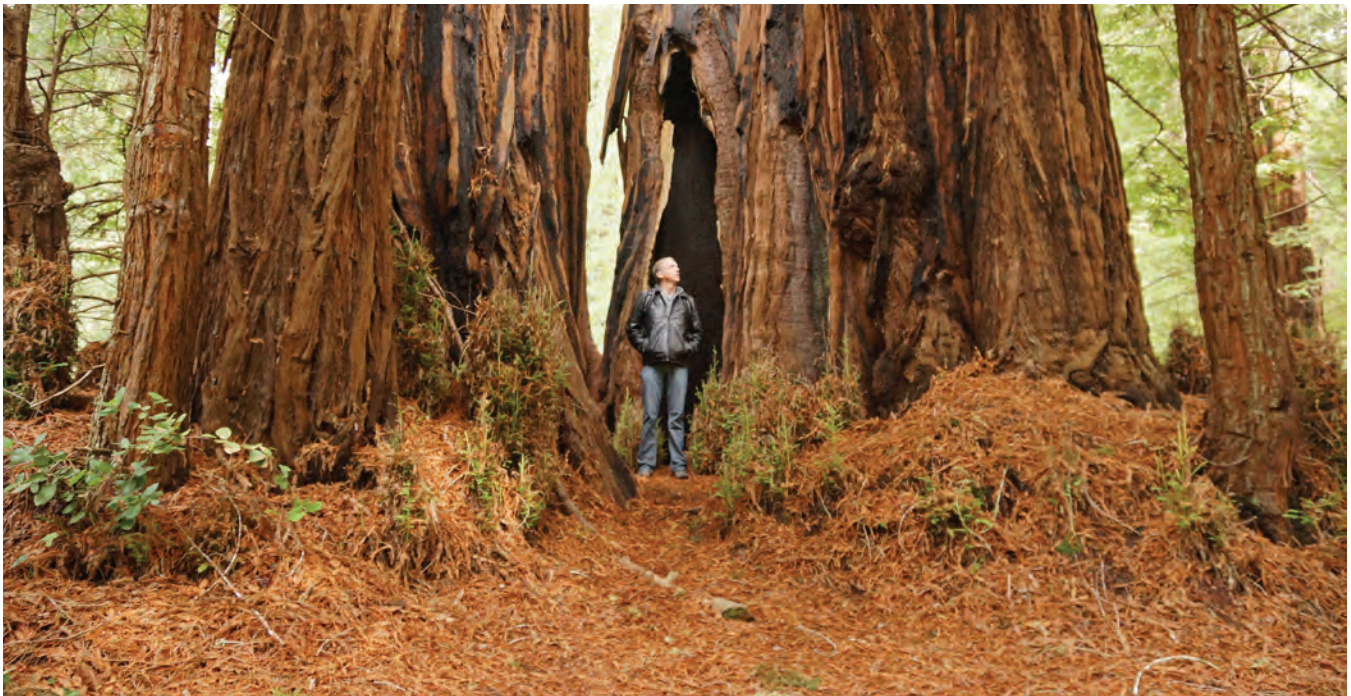
Enjoying redwood trees at Big Basin Redwoods State Park, CA.

Conserving and Restoring America the Beautiful (2021) This report responds to the 2021 Executive Order 14008, Tackling the Climate Crisis at Home and Abroad, recommending steps that the United States should take in partnership to achieve the goal of conserving at least 30% of lands and waters by 2030. The report recommends conserving lands and waters for the benefit of all people and expanding access to sustainable outdoor recreation.