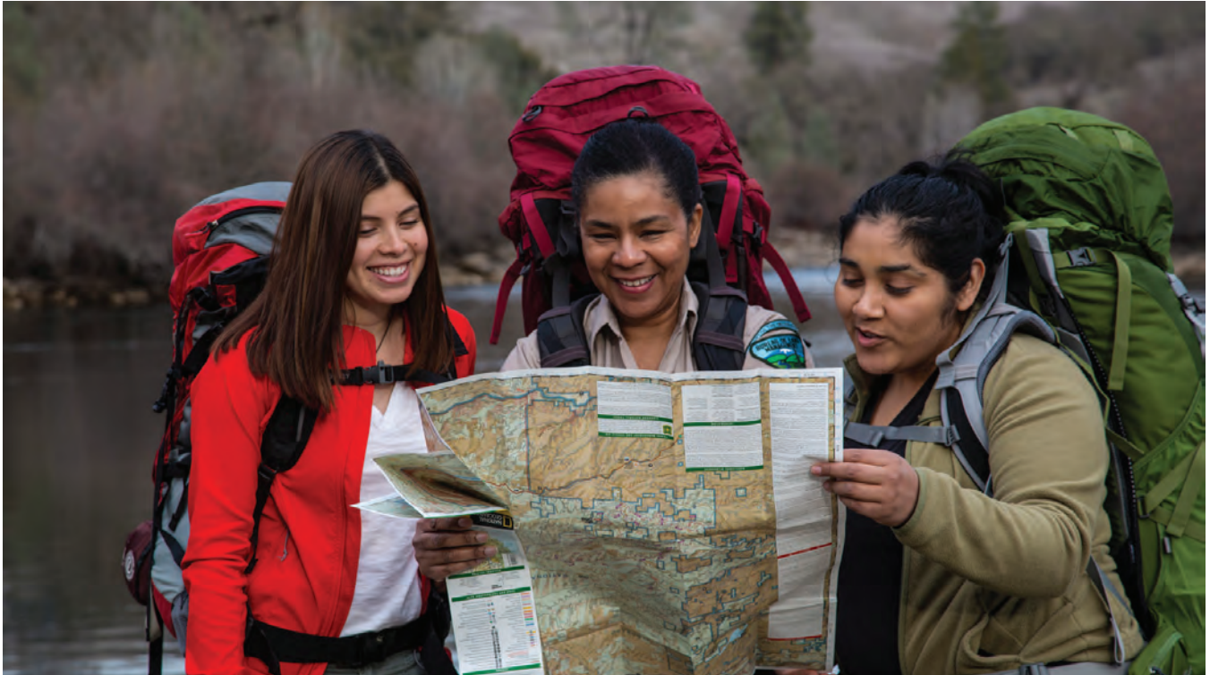
Two backpackers and a ranger look at a map at Cronan Ranch Regional Trails Park in Pilot Hill, CA.

The following guiding principles provide a foundation for all of the Goals and Key Actions of the Joint Strategy, ensuring that the Joint Strategy is achieved broadly and equitably across California.