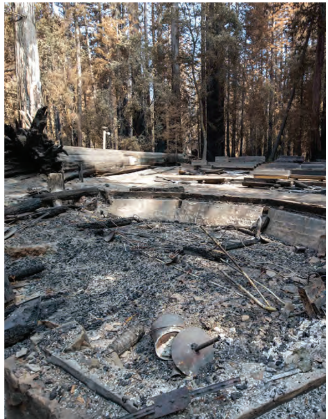
Before and after photos of an outdoor amphitheater at California’s Big Basin Redwoods State Park, which burned during the CZU Complex Fire in 2020.