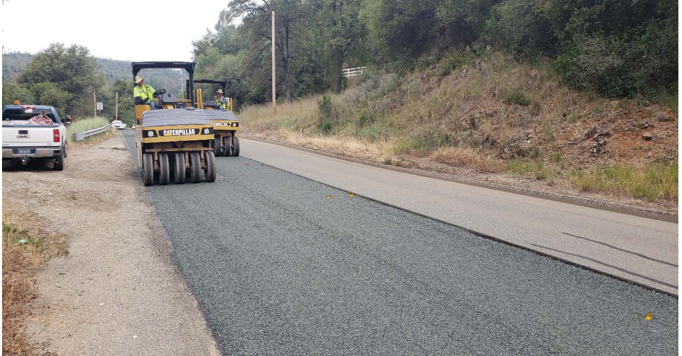
Placing chip seal in Alta Sierra

County of Nevada Community Development Agency Department of Public Works 2020-2021 thru 2024-2025