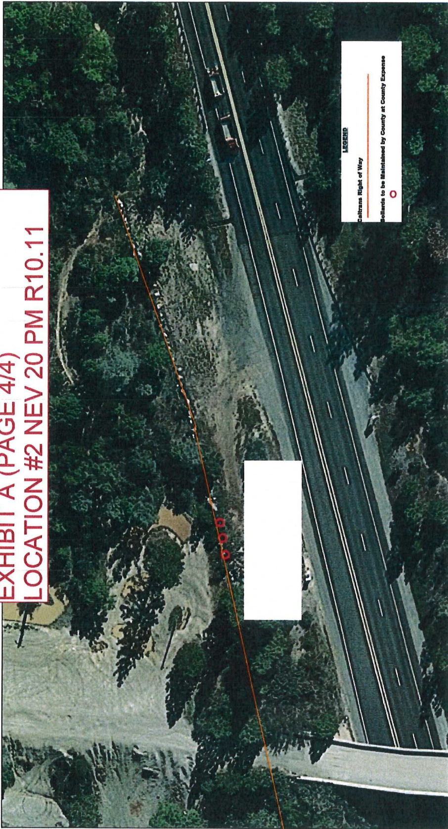
EXHIBIT A (PAGE 4/4) LOCATION #2 NEV 20 PM R10.11

LEGEND Caltrans Right of Way Coltards to be Maintained by County at County Expense