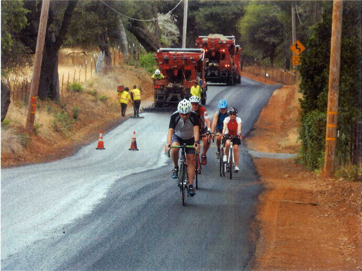
Bicyclists Traveling Through the 2018 Road Rehabilitation Project

County of Nevada Community Development Agency Department of Public Works 2018-2019 thru 2022-2023