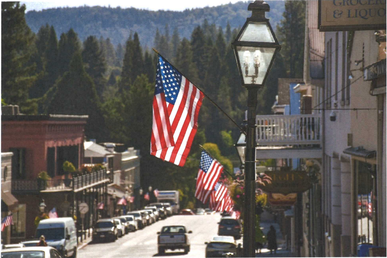
Broad Street, Downtown Nevada City