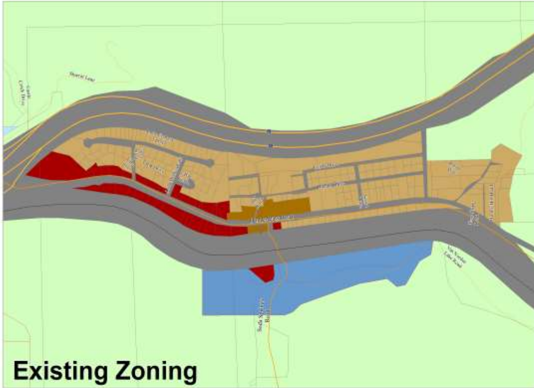
Exhibit A Soda Springs Area Plan Zoning District Map Amendments