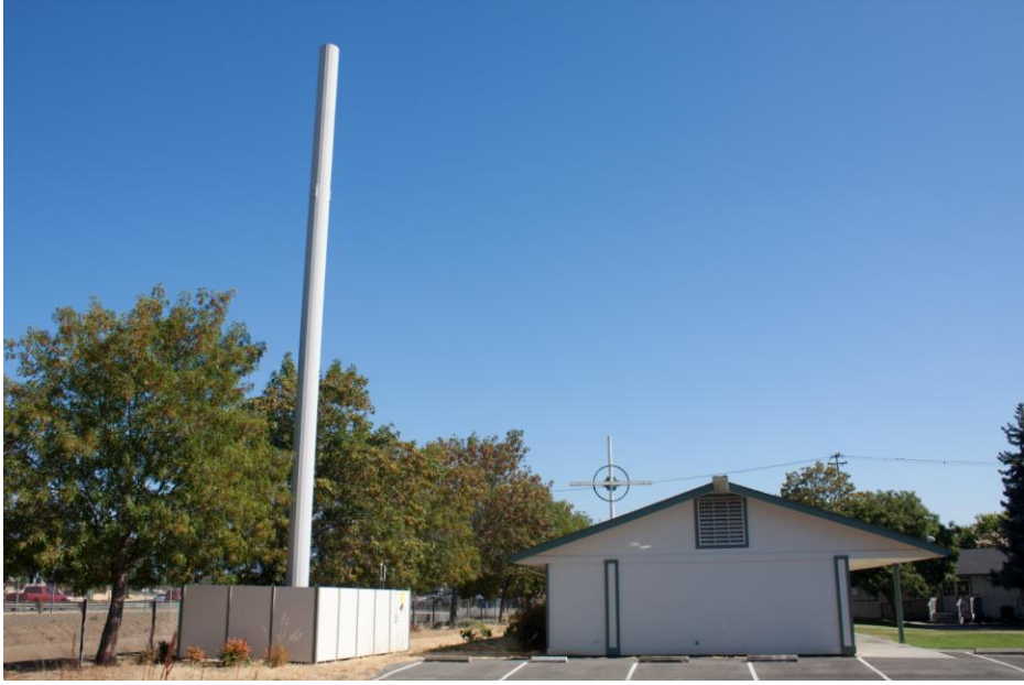
3675 Payne, San Jose