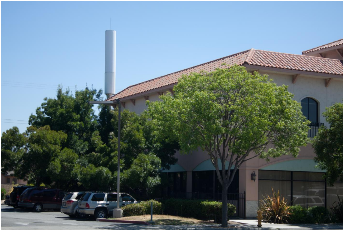
2110 Story Road, San Jose