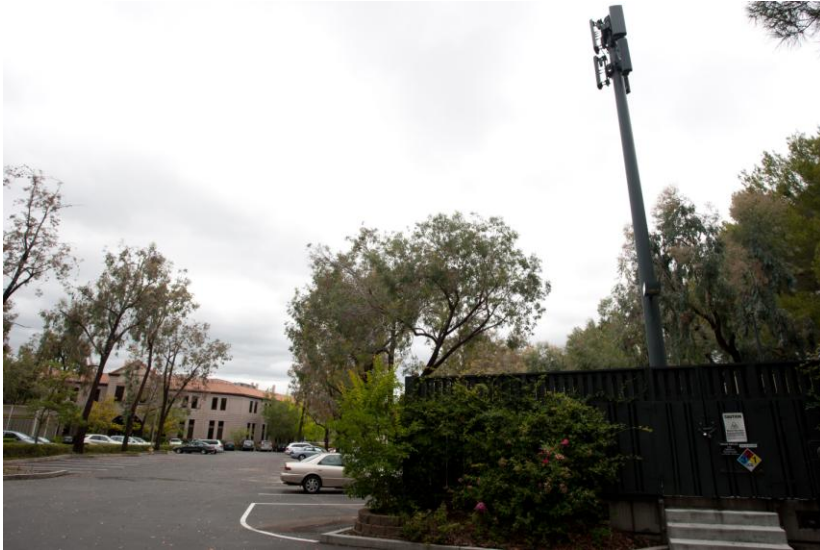
4009 Miranda, Palo Alto