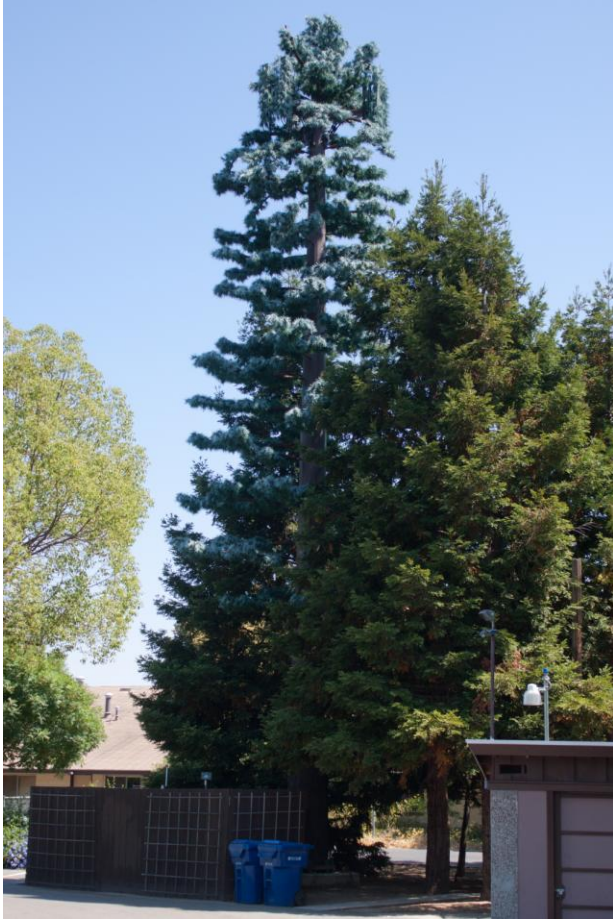
12770 Saratoga Ave, Saratoga