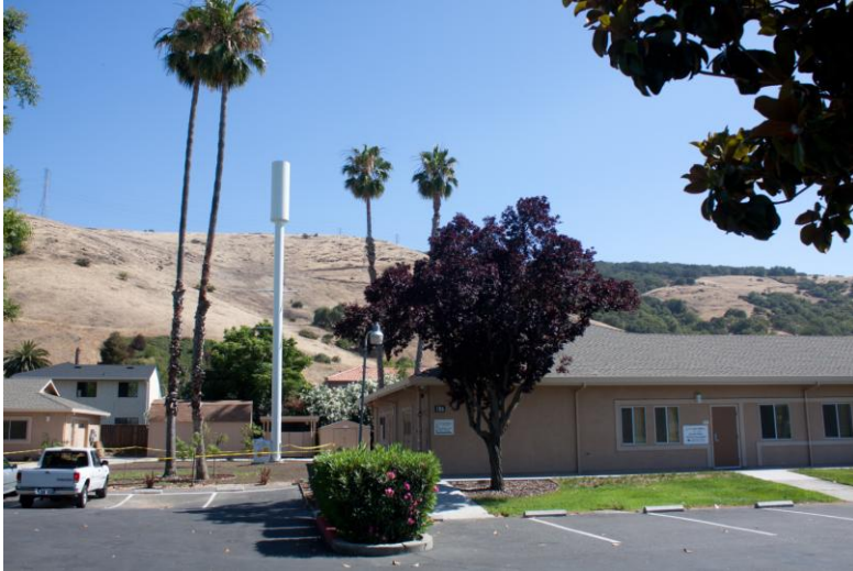
366 St. Julie Drive, San Jose