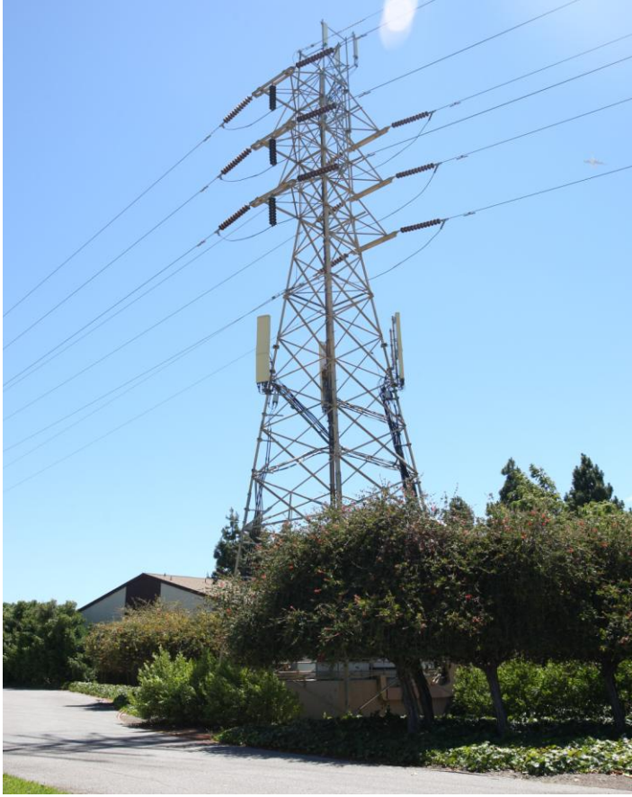
1082 Colorado St. Palo Alto