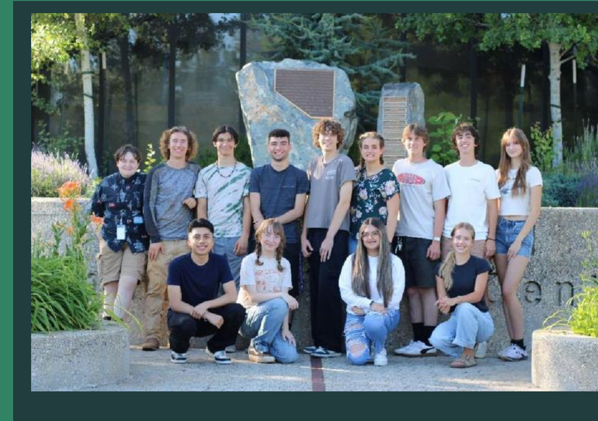
June '24 - End of Term