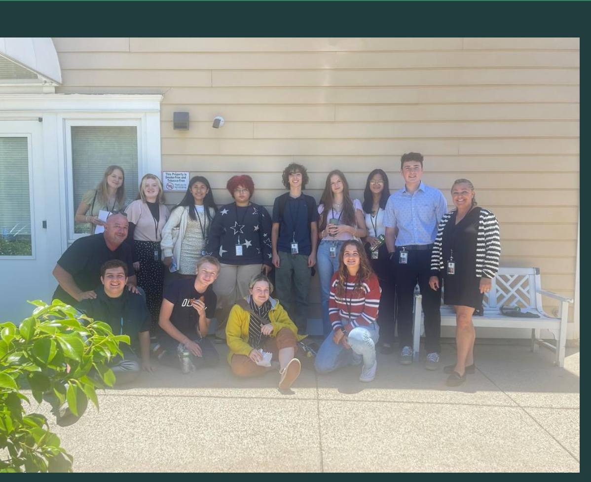
Summer '23 - Founding