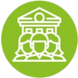
Fiscal Stability/ Core Services