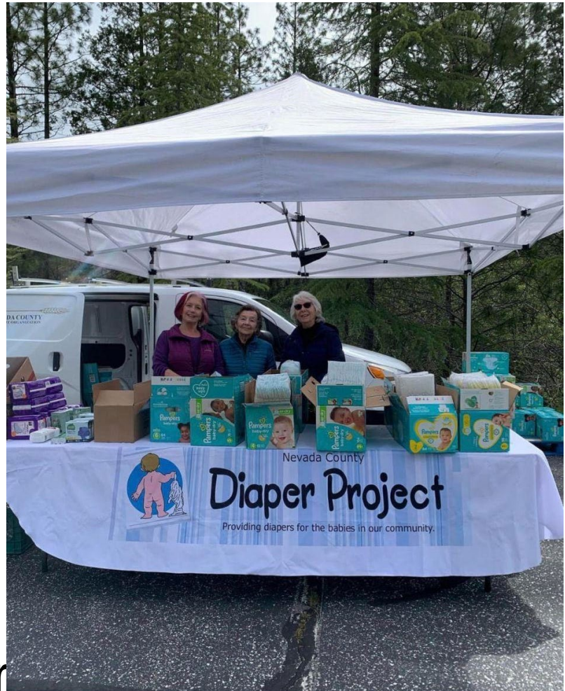
Images of our programs at work