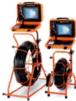
Gen-Eye SDW Color Camera System, 400' Push-Rod, Locator & Wi-Fi