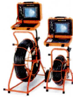
Gen-Eye SDP Color Camera System w/ 200' Push-Rod & Locator