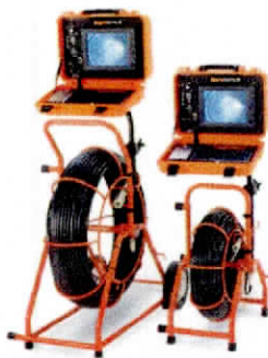
Gen-Eye SDW Color Sewer Camera System, 300' Push- Rod, Locator & Wi-Fi