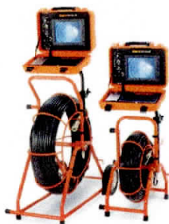
Gen-Eye SDW Color Camera System, 200' Push-Rod & Wi- Fi