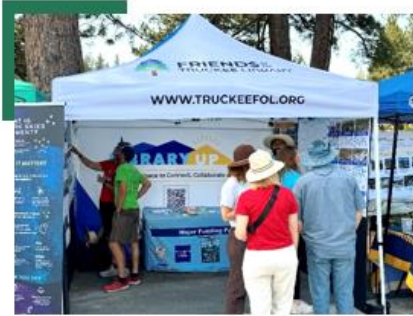
Truckee Day Community Expo – 06/01

Through these events and options nearly 4,000 survey responses were collected!