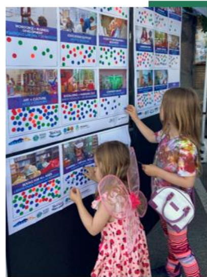
Truckee Thursdays – 06/27