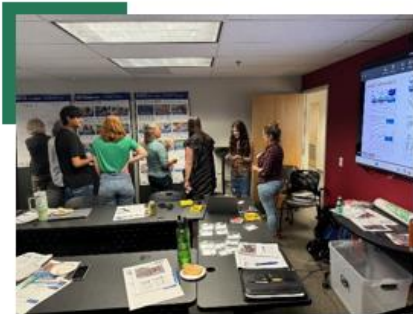
Project Task Force Meeting – 05/30