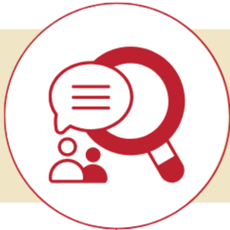
All County Survey