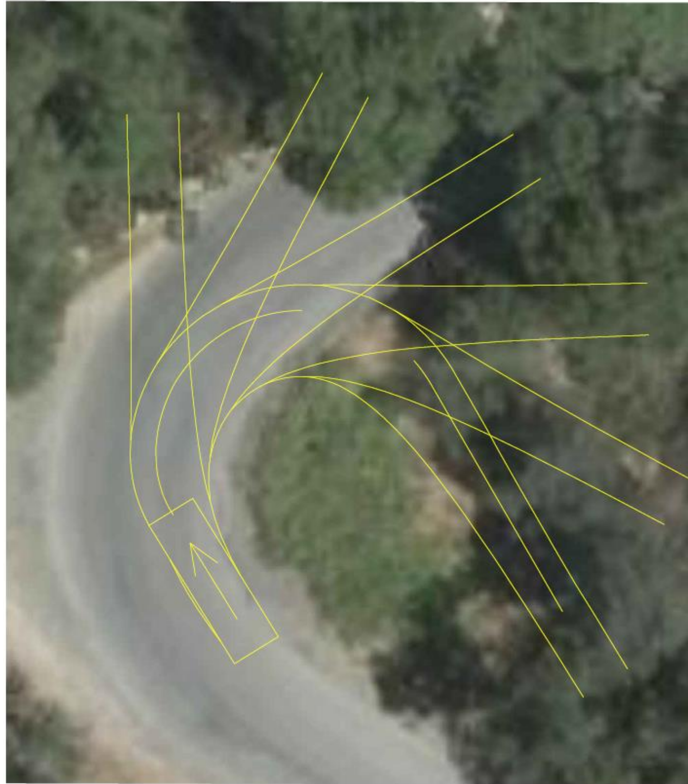
27 ft Truck Swept Path