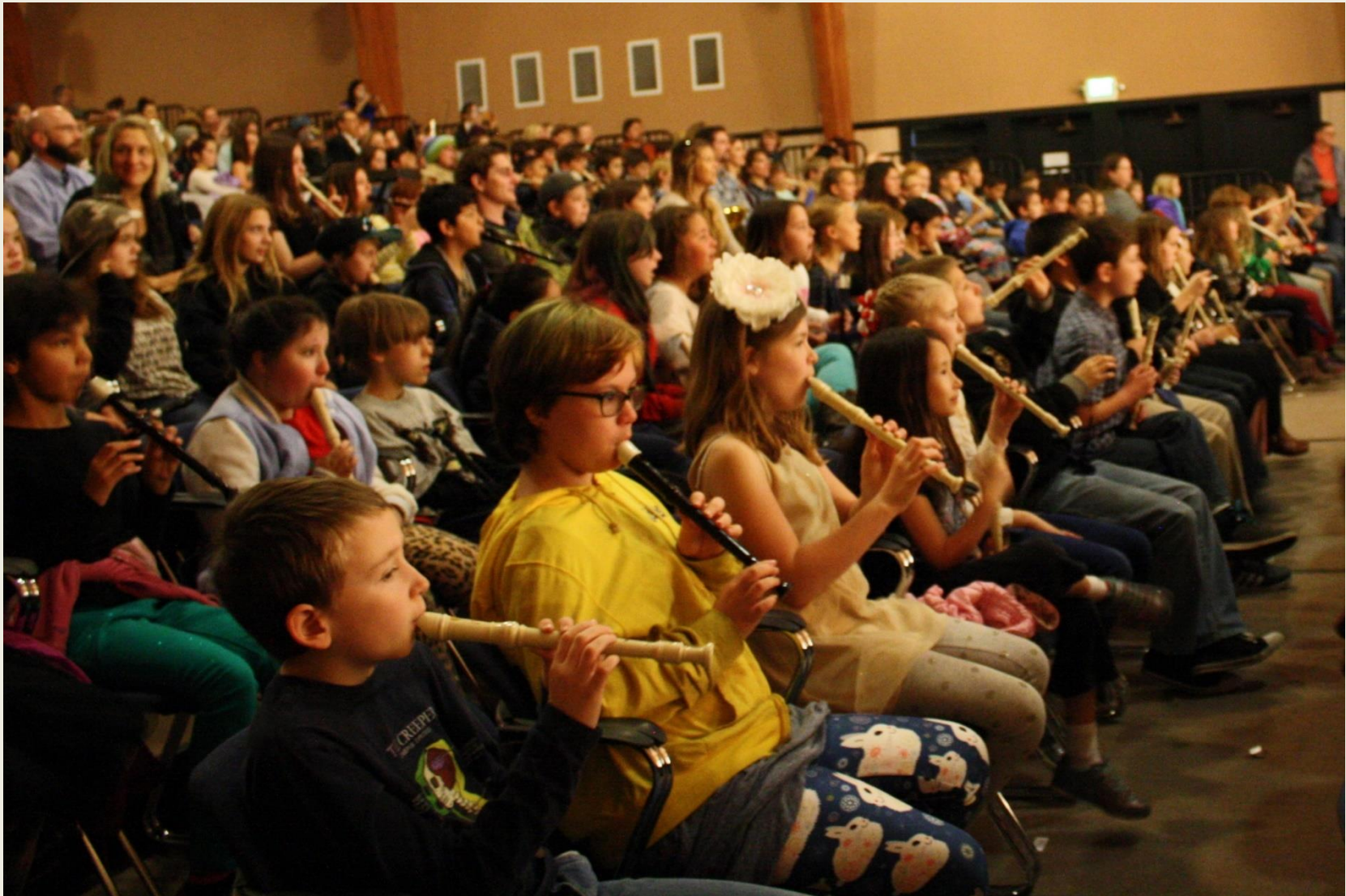
Music in the Mountains' Link Up recorder concert with Carnegie Hall.