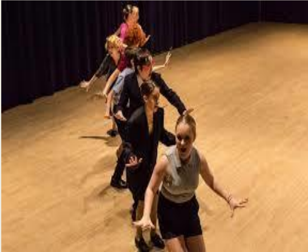
Nevada Union's Theatre Arts Improv Class

A well-rounded arts education has proven to increase student attendance, create connections to curriculum, and build positive behavior, creating a stronger learning environment.