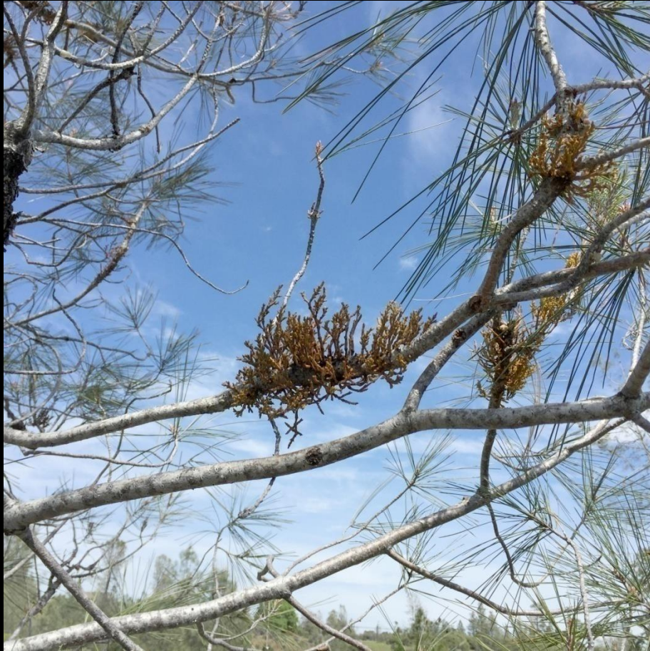
Dwarf Mistletoe Fruiting Body