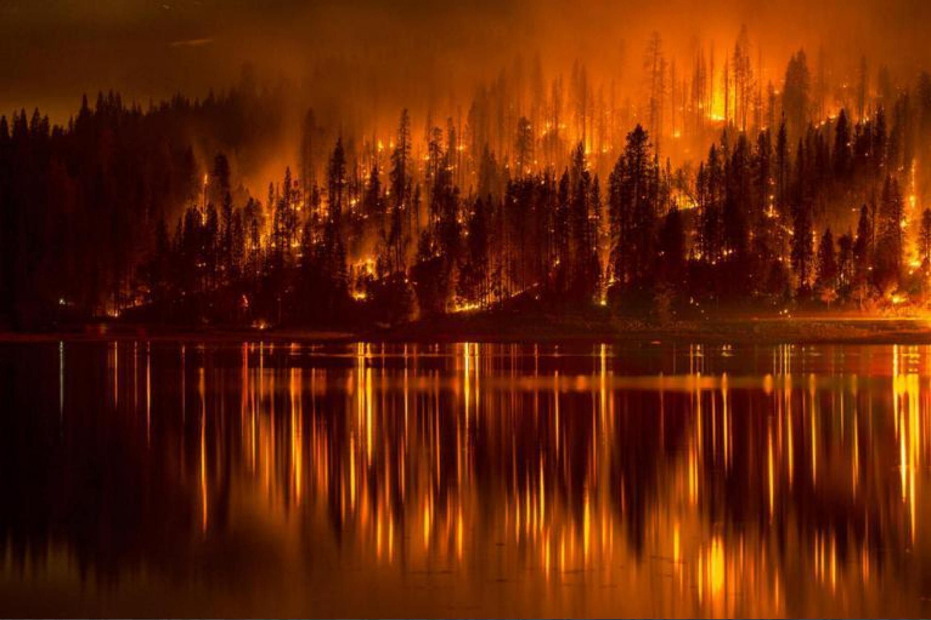
Stumpy Meadows Reservoir, El Dorado County