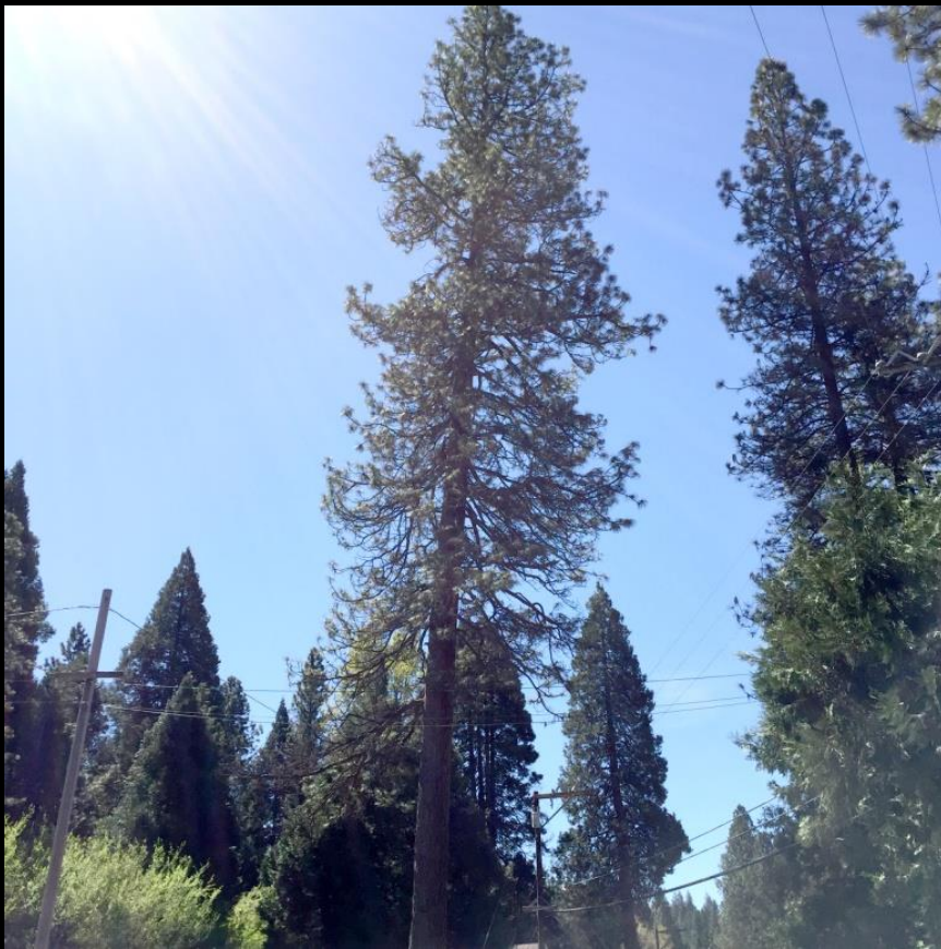
Green, But Dead