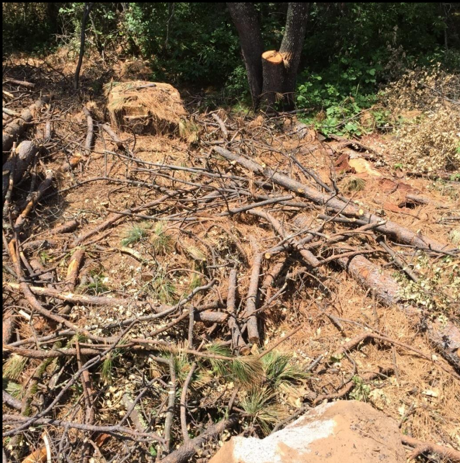
Limbs and Tops