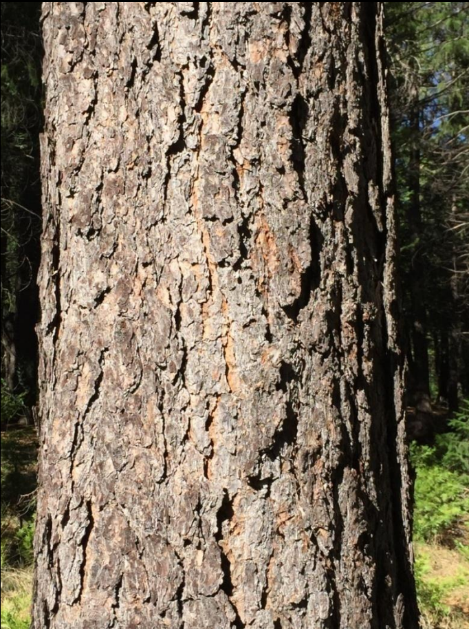
Bark Exhibits Rapid Growth