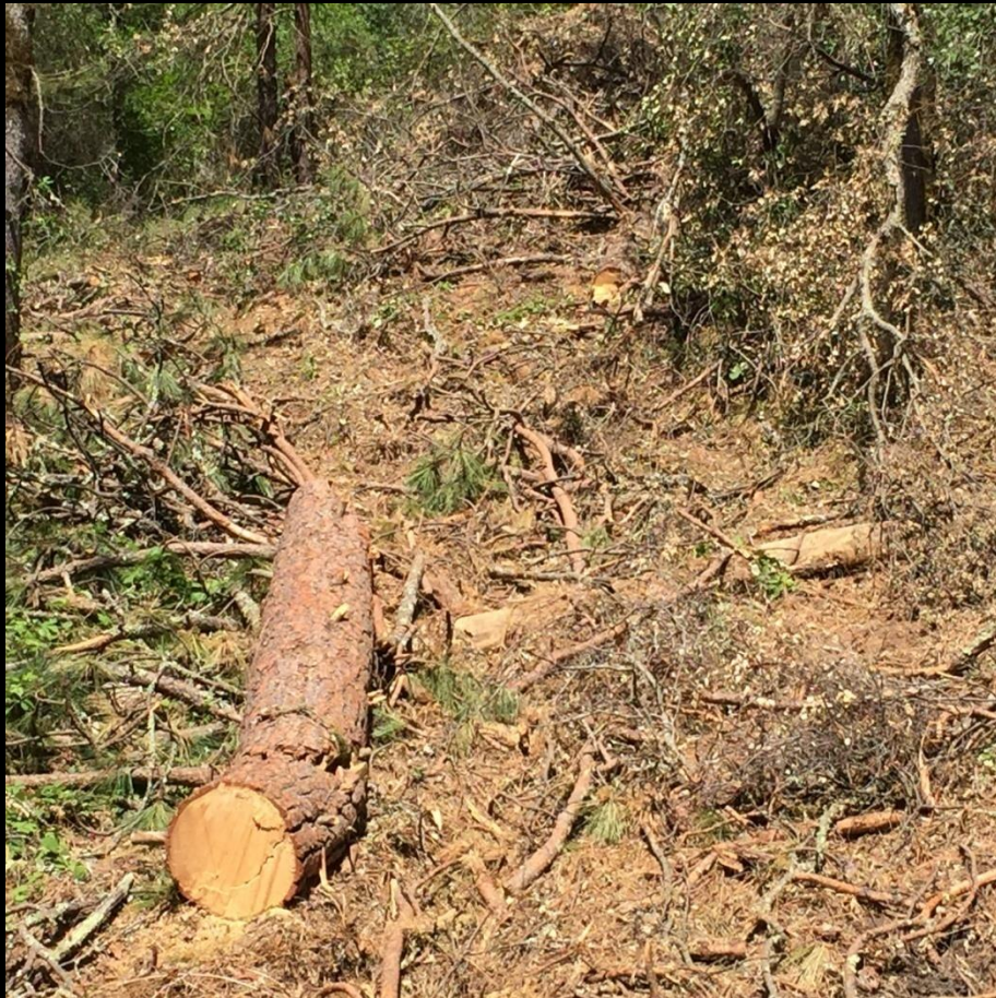
Large Chunks, Limbs, & Tops