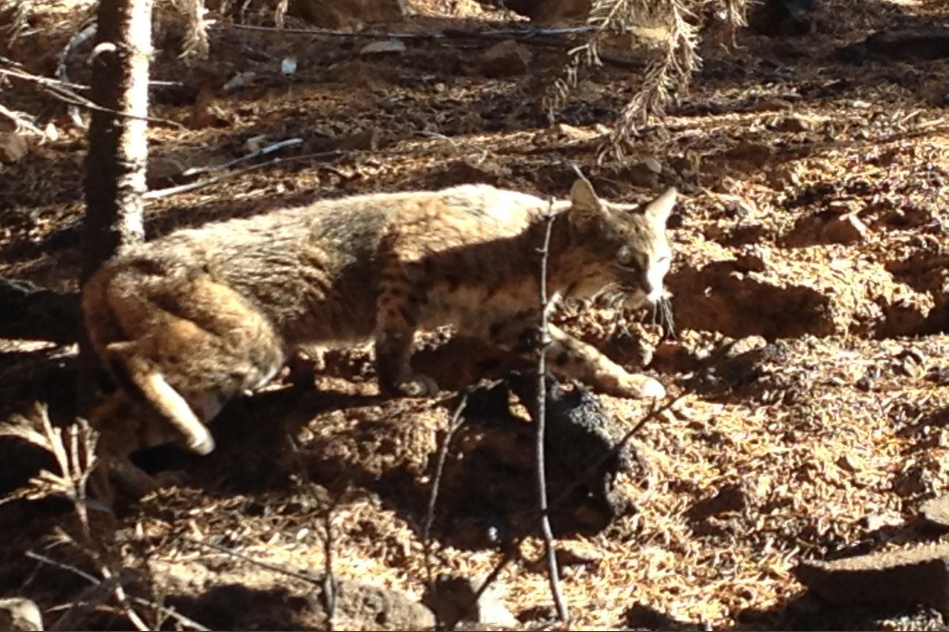
Starving Bobcat with Burned Pads