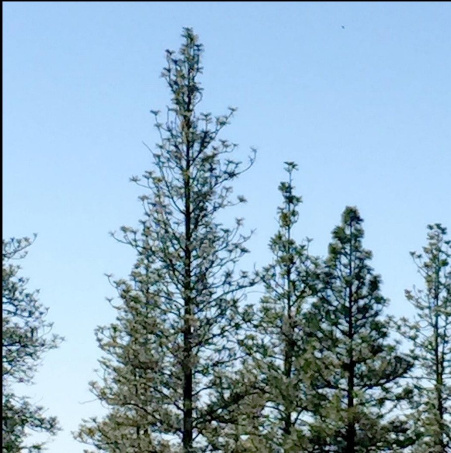
Lion's Tailing Due to Age in Ponderosa Pine