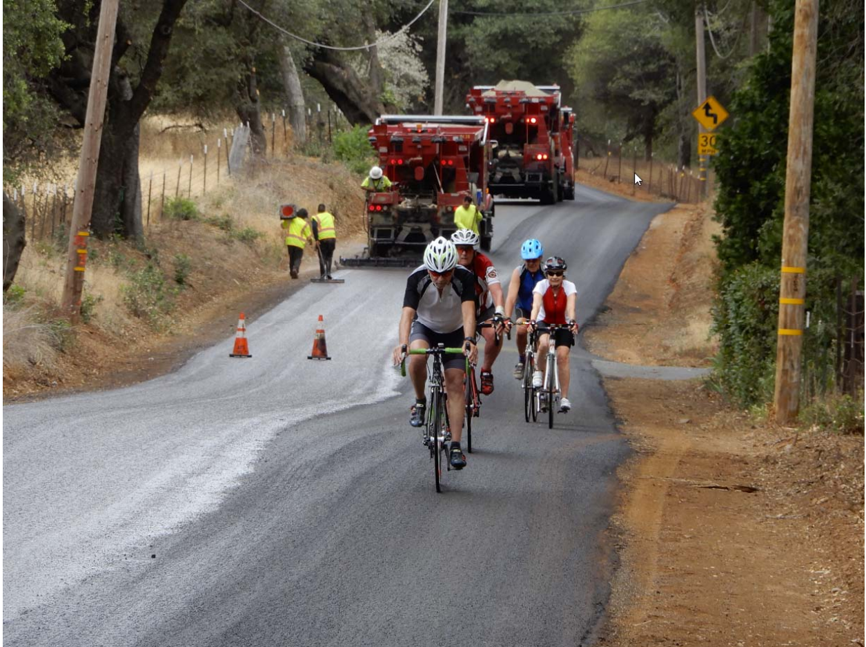
Bicyclists Traveling Through the 2018 Road Rehabilitation Project

County of Nevada Community Development Agency Department of Public Works 2018-2019 thru 2022-2023