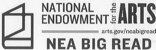
Managed by Arts Midwest

We have provided two variants of the NEA Big Read logo for your use. Both variants have .JPG and .EPS formats.