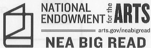
Managed by Arts Midwest

Be sure to include the credit line (noted below).