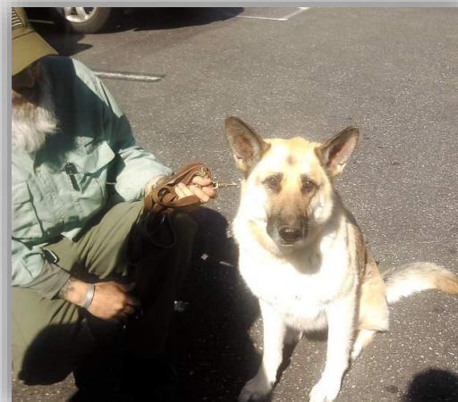
March 2015