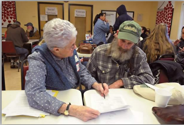
January 2017