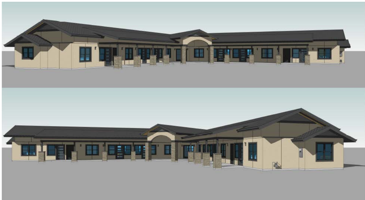
Figure 3: Building Elevations

The Project consists of demolition of the existing 1,791 S.F. Ranch House and replacing it with a new 6-plex consisting of six (6) one-bedroom per unit apartment complex. The proposed new structure is 3,631 S.F. in size and would continue to be used for supportive housing. The new structure is a single-story “L” shaped building with three units on each side and a common area in the middle. Unit sizes range from 400 S.F. to 410 S.F. The new structure is basically in the same location as the existing residence.