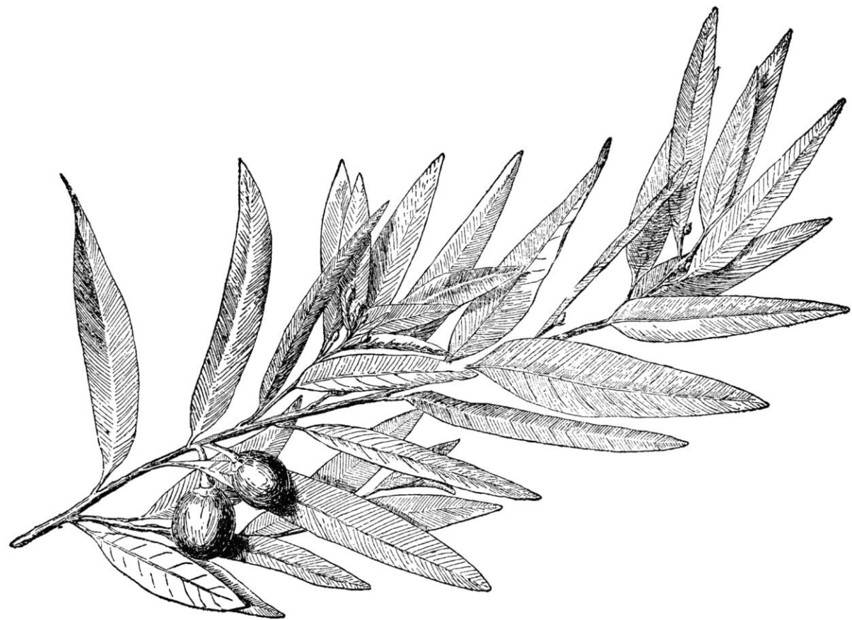
Laurel leaves, a symbol of honor in ancient Greece.