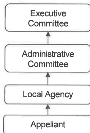
Exhibit 5: RTMF Appeals Flowchart

At the conclusion of the thirty (30) day period, the Executive Committee shall render a written decision on the appeal. The decision of the Executive Committee shall be final.