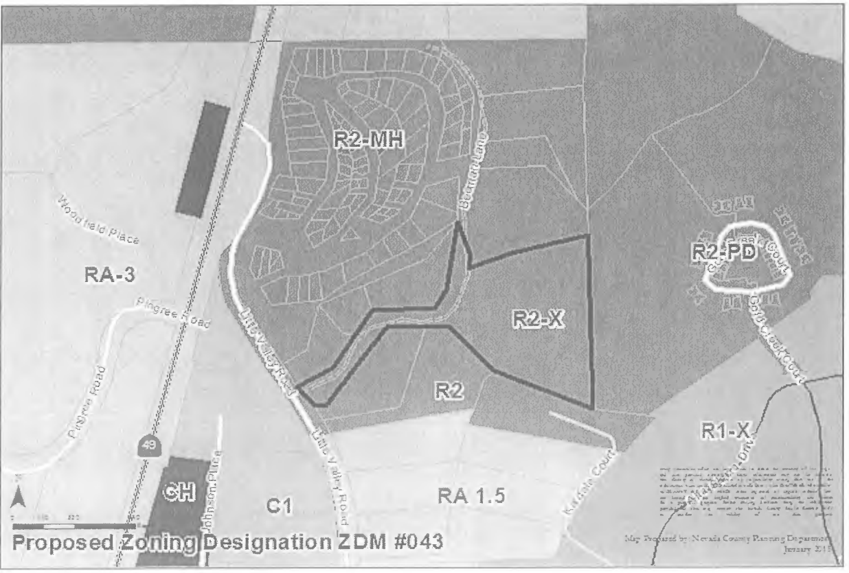
Proposed Zoning Designation ZDM #043

Map Prepared by Nevada County Planning Department January 2013