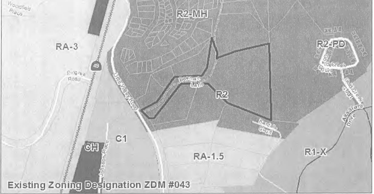
Existing Zoning Designation ZDM #043