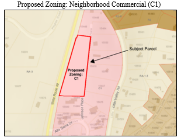
Figure 1: Existing and Proposed Zoning