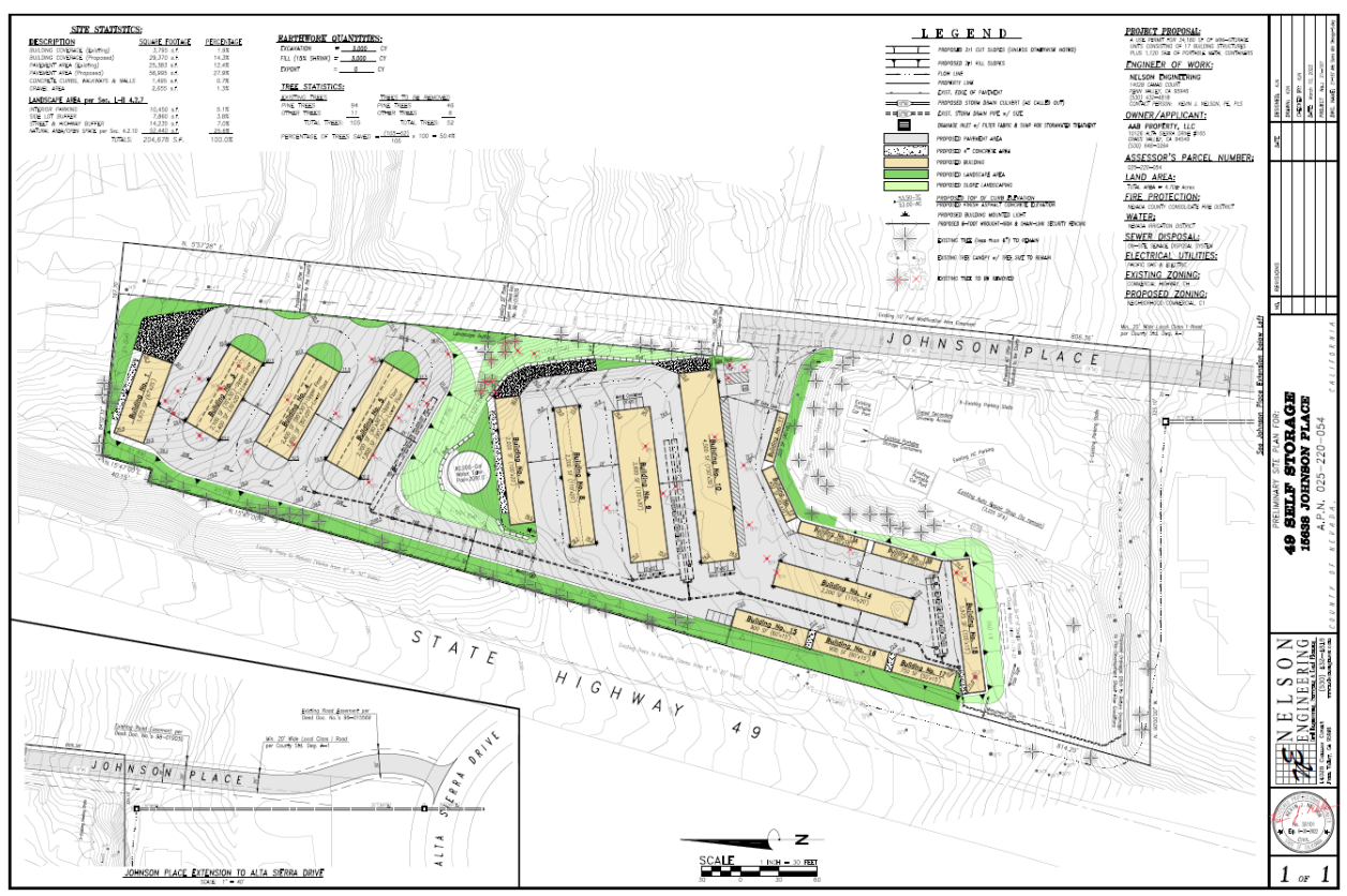
Figure 2: Site Plan

Board of Supervisors June 28, 2022 Page 4 of 8