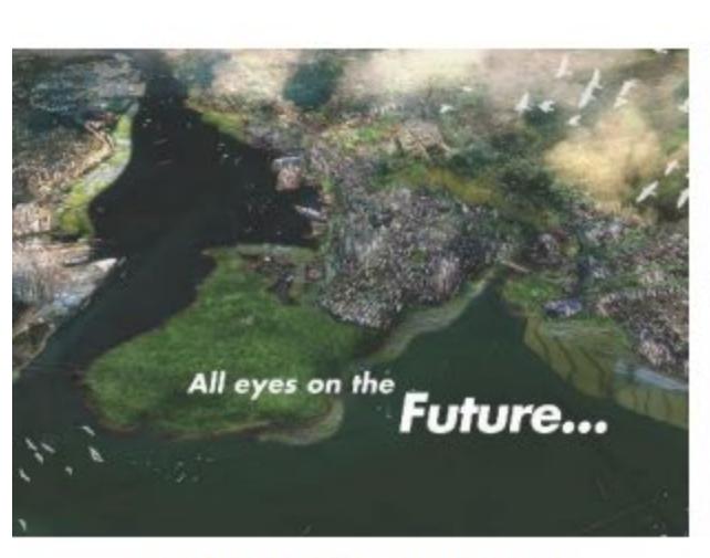
VANCOUVER PARKS AND RECREATION PLAN (VanPlay)