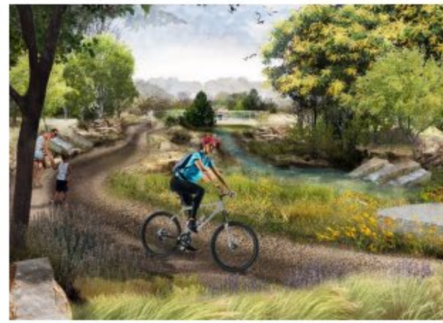
LOUDOUN COUNTY TRAILS PLAN