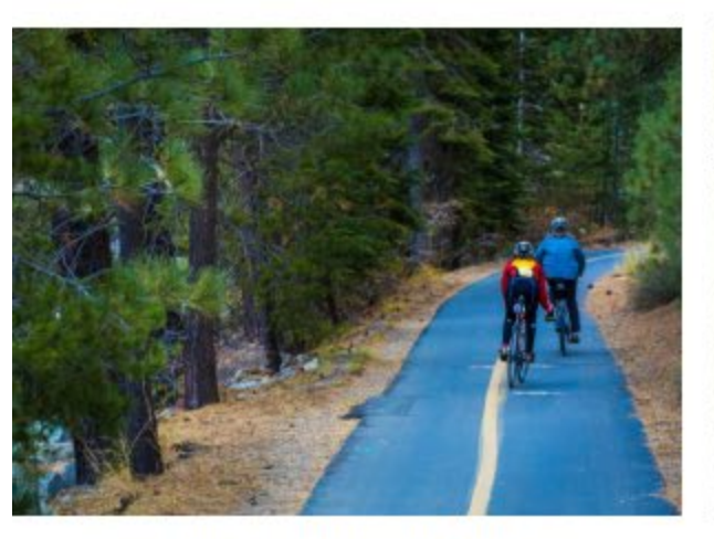
PLACER COUNTY PARKS & TRAILS PLAN