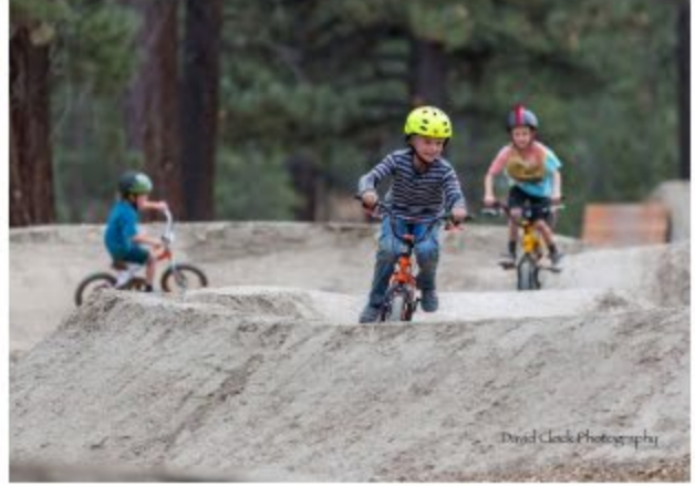
BIJOU BIKE PARK