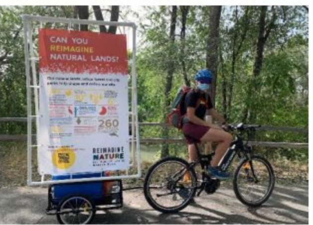
SALT LAKE CITY PUBLIC LANDS & TRAILS PLAN