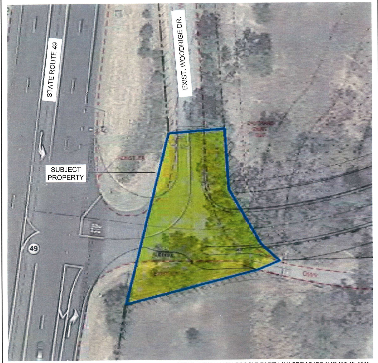
AERIAL IMAGE FROM GOOGLE EARTH, IMAGERY DATE AUGUST 16, 2018 BASE MAP FROM KING ENGINEERING INC., DECEMBER 12, 2018