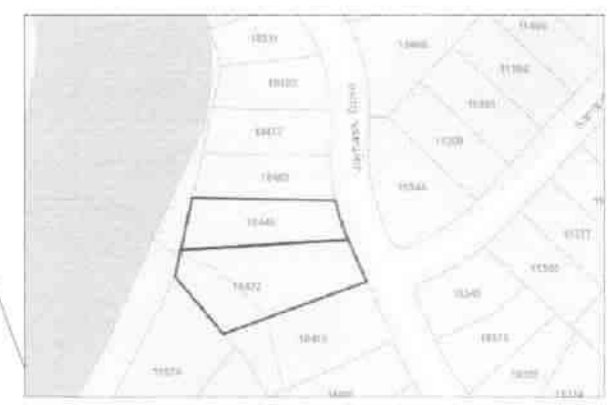
LOCATION MAP Scale: 1" = 200'

MAP BY: California Survey Company 136 Idaho Maryland Rd. Grass Valley, CA 95945 (530) 273-6651