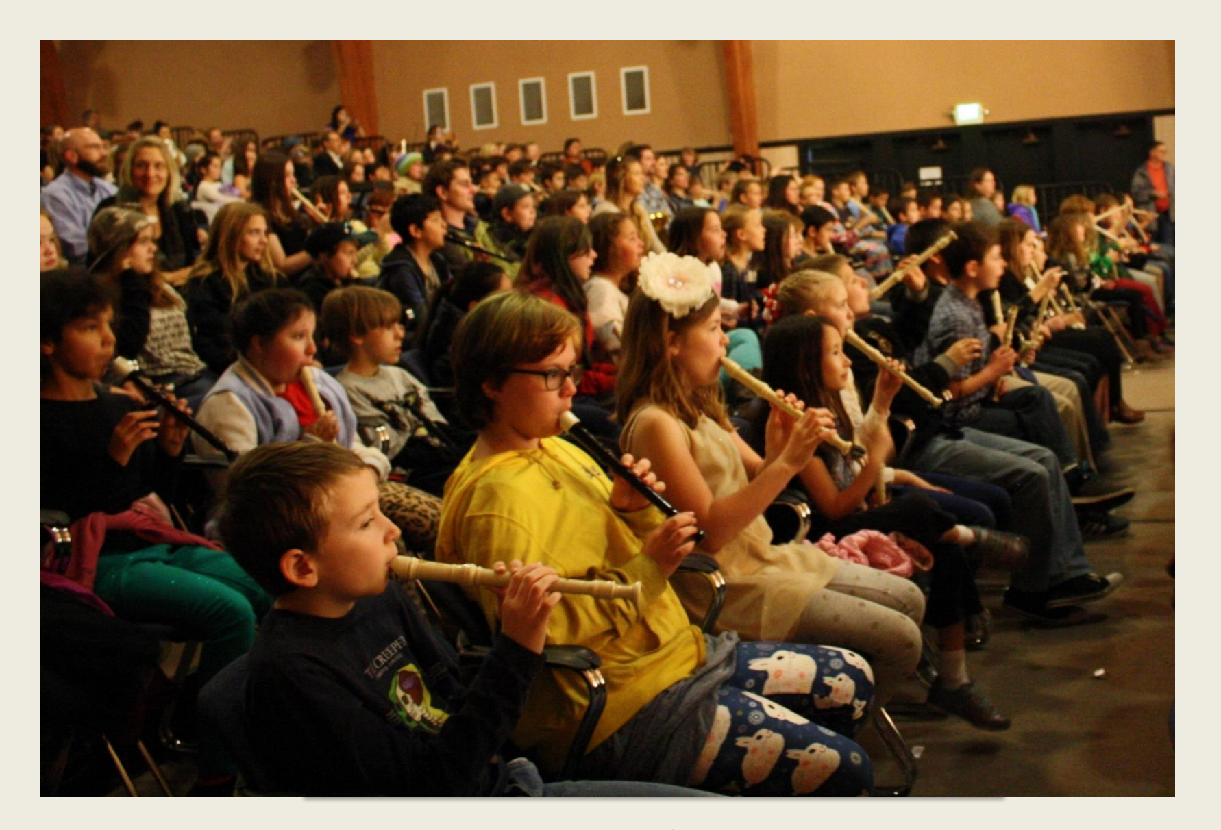
Music in the Mountains' Link Up recorder concert with Carnegie Hall.