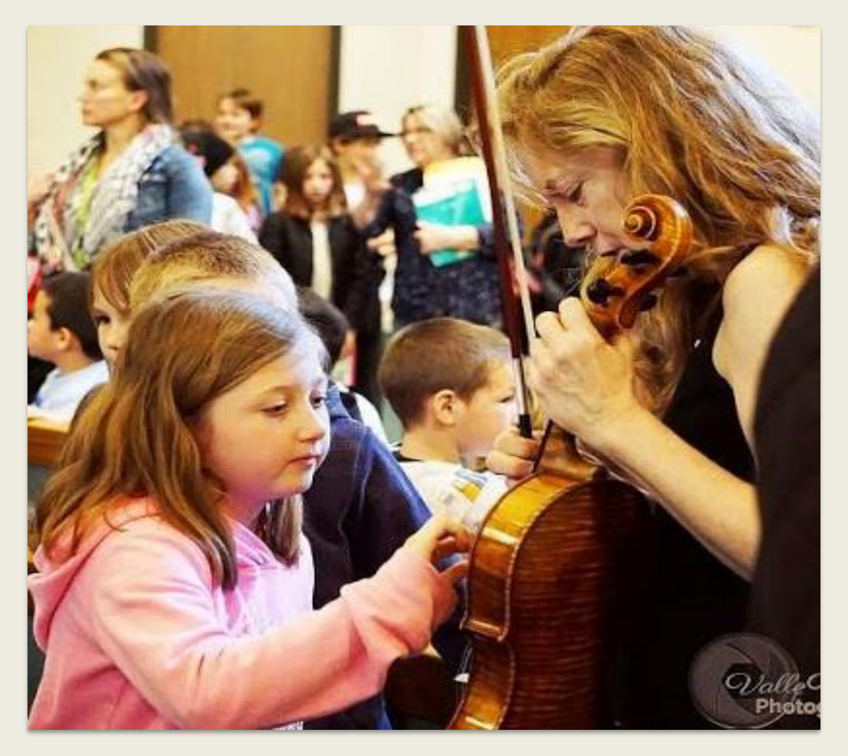
InConcert Sierra's county-wide 3<sup>rd</sup> grade live Music concert every spring.