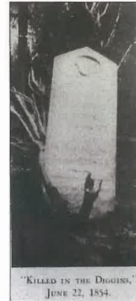
"KILLED IN THE DIGGINS," JUNE 22, 1854.