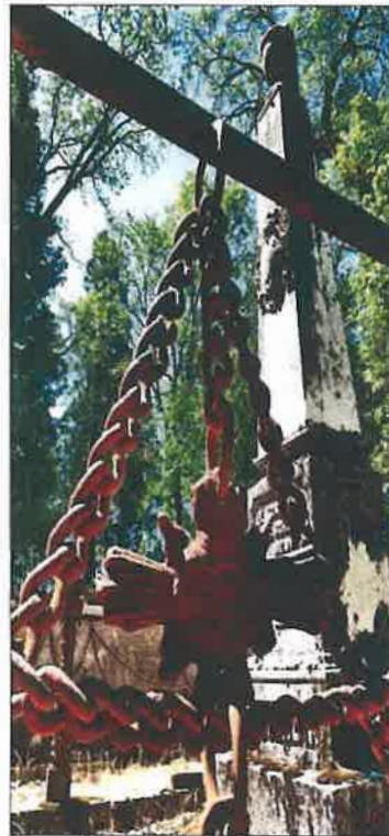
All-seeing eye, visible at a Masonic graveside.

(According to the Nevada Cemetery District)