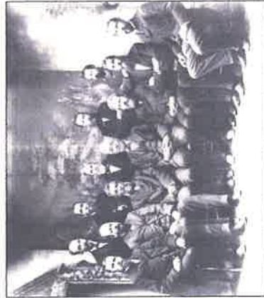
Pioneers of North San Juan

The North San Juan Protestant Cemetery (NSJPC) is an integral component of the early ridge community. The oldest remaining grave monument (known) dates to 1851 (young XXXXX) and burials are thought to have occurred before that, as early as 1850. Historically, the NSJPC has served a large population. It is estimated that about 800 of the historic-era citizenry of North San Juan, Birchville, Cherokee, Sebastopol, Sweetland and North Columbia areas all used the cemetery and are represented therein. The grave monuments vary greatly; elaborate imported white marble columns, cast and wrought-iron works, regional granite tablets and obelisks and simple wooden or angle-iron crosses and alloy placards populate the cemetery grounds, amongst the towering Black Oaks, Cedars and Cypress.