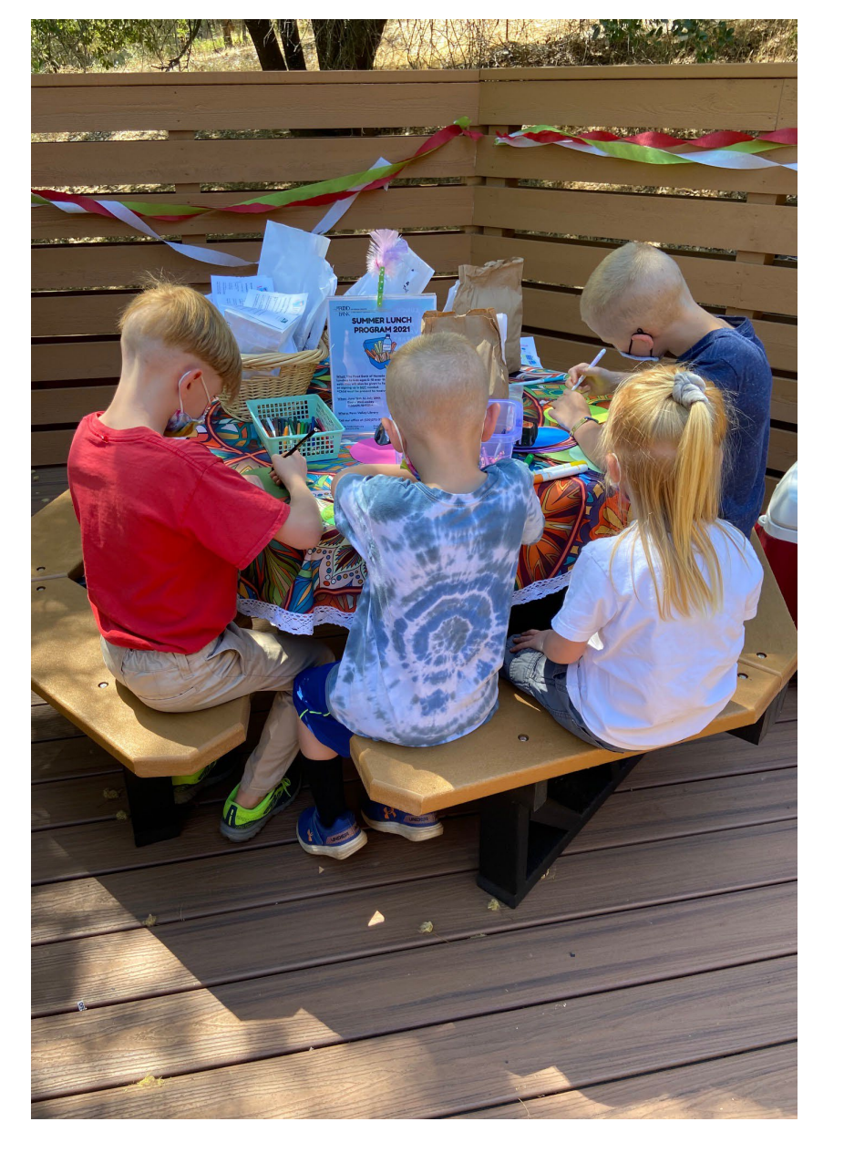
Lunch and crafts outside the Penn Valley Library