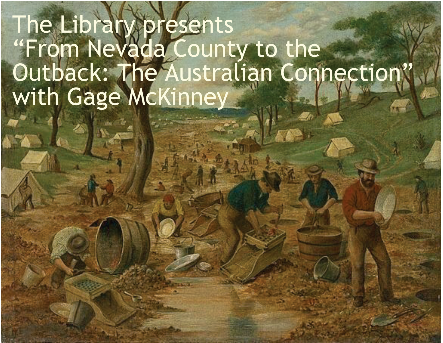
“An Australian Gold Diggings,” painting by Edwin Stockqueler.