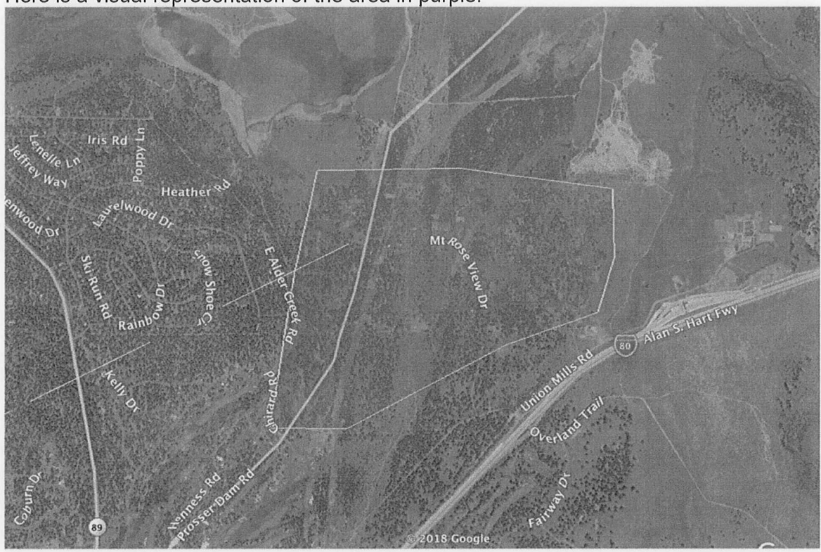
KMZ File is in Google Folder called "Prosser Dam Project Area"

Here is a visual representation of the area in purple.